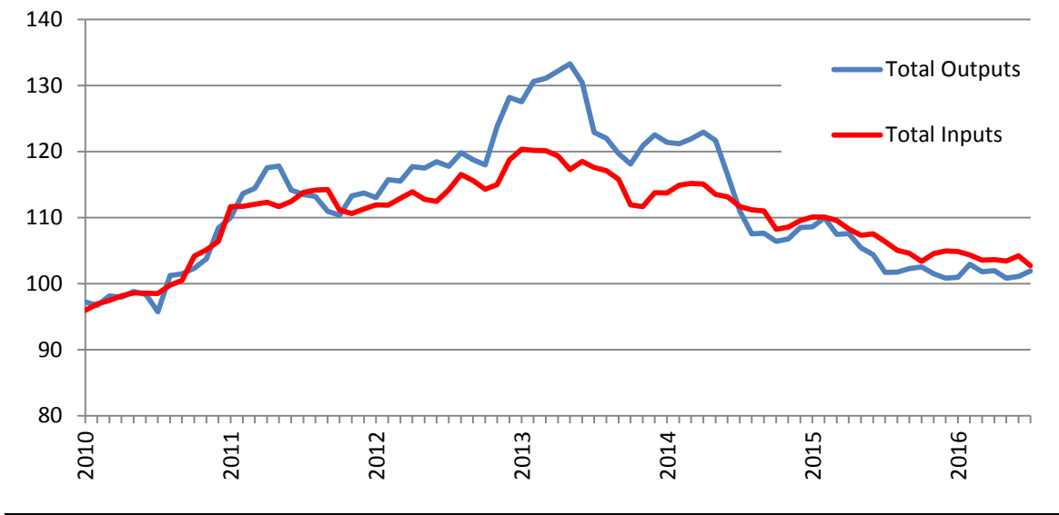
Figure 1: Monthly indices for total Outputs and total Inputs

Figure 1 shows the monthly price indices for total agricultural inputs and outputs from January 2010 to July 2016.