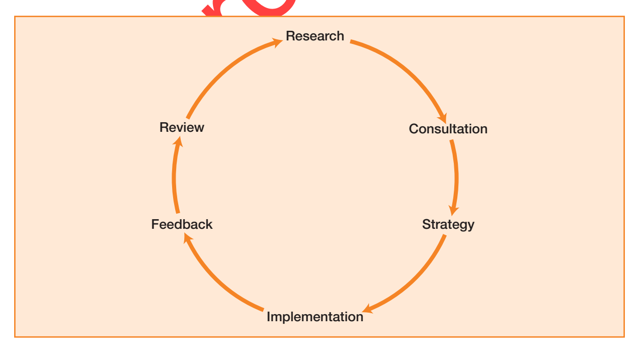
Figure 2: The strategic process

A good strategy should determine priorities for action and help all staff and partners to understand what is needed and why. It should be based on sound evidence and extensive consultation with all relevant stakeholders. It should lead to specific, measurable, achievable, realistic and timetabled (SMART) outcomes that have a clear and beneficial impact on those targeted. Such outcomes should be monitored and evaluated so that they can inform any review of the strategy and its objectives, and lead to progressive improvements. It is particularly important that homelessness strategies with specific objectives for ethnic minority populations should be kept under regular review because the circumstances and needs of most ethnic minority communities change very rapidly.