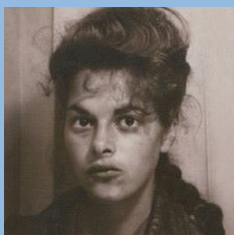
Tracey Emin, CBE Artist