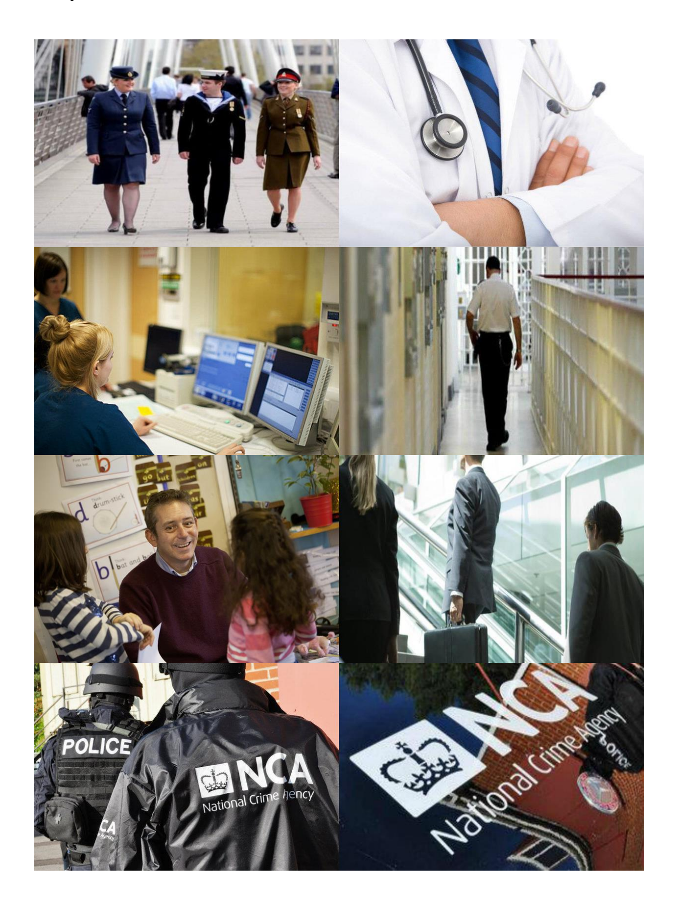
Chapter 2: The Work of the Teams