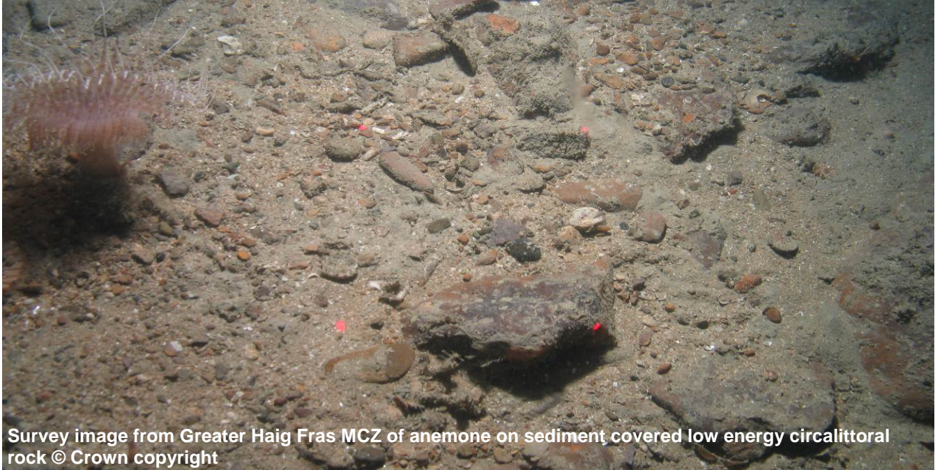
Survey image from Greater Haig Fras MCZ of anemone on sediment covered low energy circalittoral rock