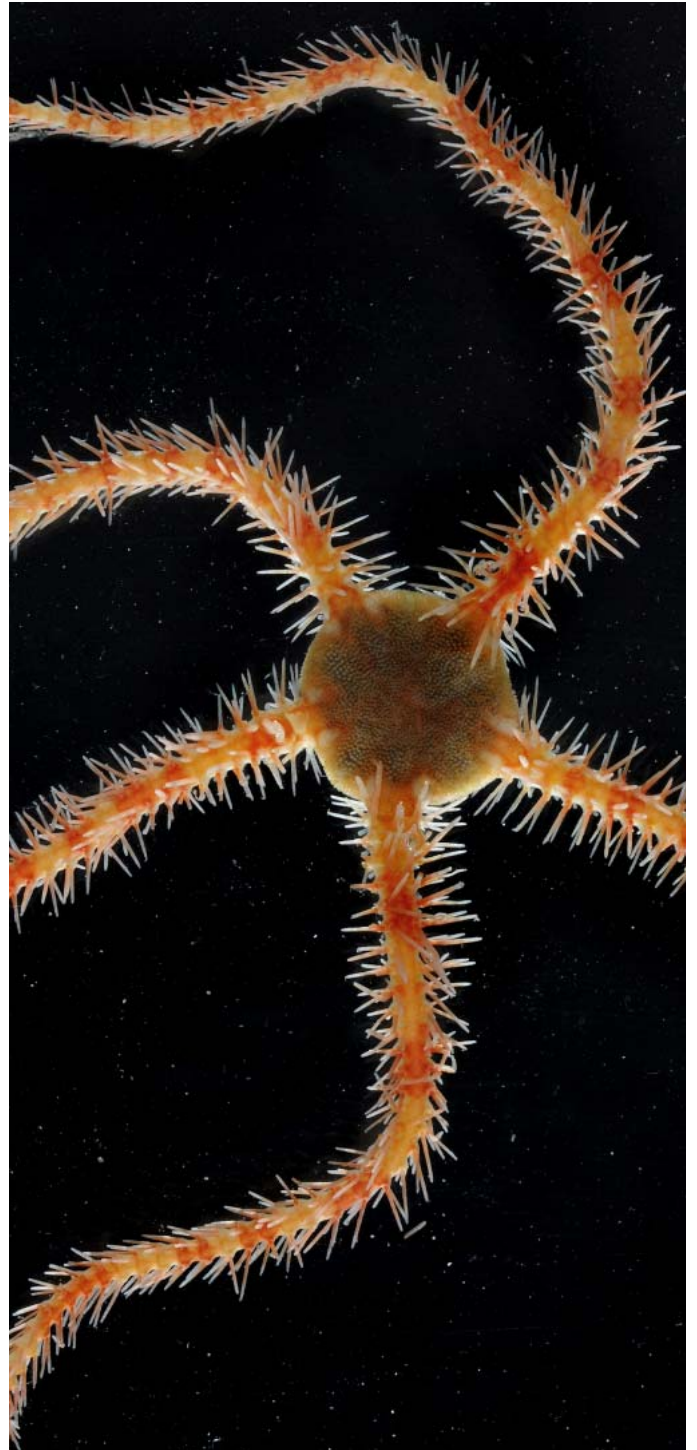
Brittle star, Bellingshausen Sea, Antarctica