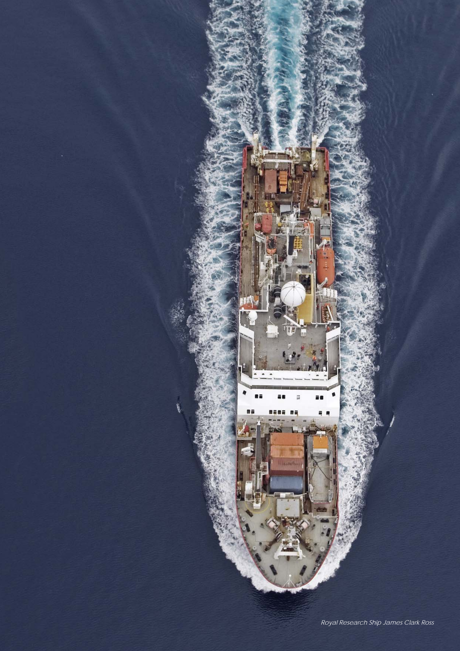
Royal Research Ship James Clark Ross