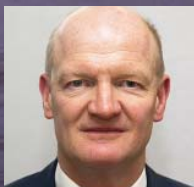
David Willetts MP Minister of State for Universities and Science

Innovation and research are at the heart of the UK growth agenda. The advancement of Antarctic knowledge and understanding is essential to a promising future for the UK. As the key Ministers with responsibilities for investment and increased national and international collaboration in Antarctic research, infrastructure and governance, we expect UK polar science to continue to be amongst the best in the world.