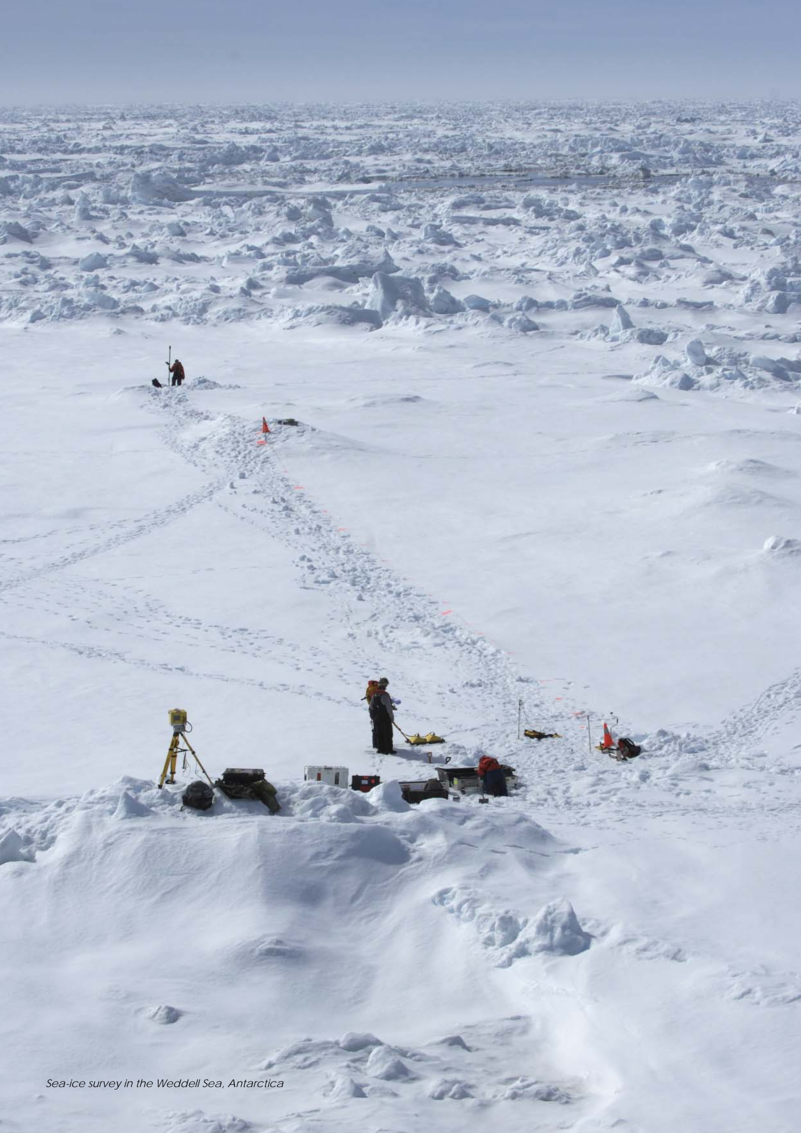
Sea-ice survey in the Weddell Sea, Antarctica