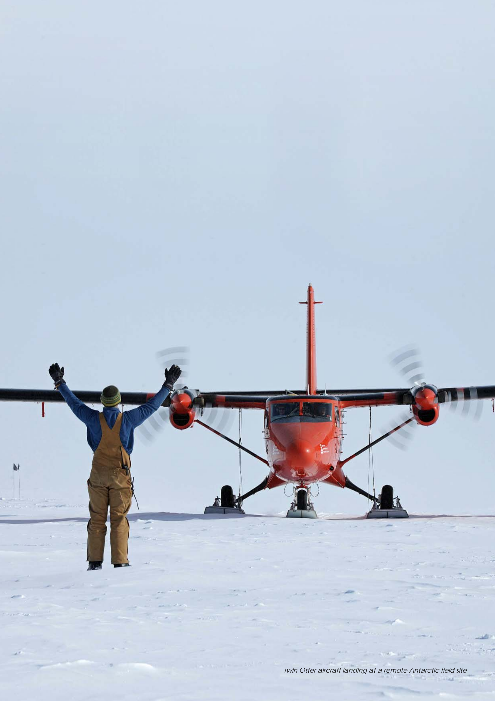
Twin Otter aircraft landing at a remote Antarctic field site