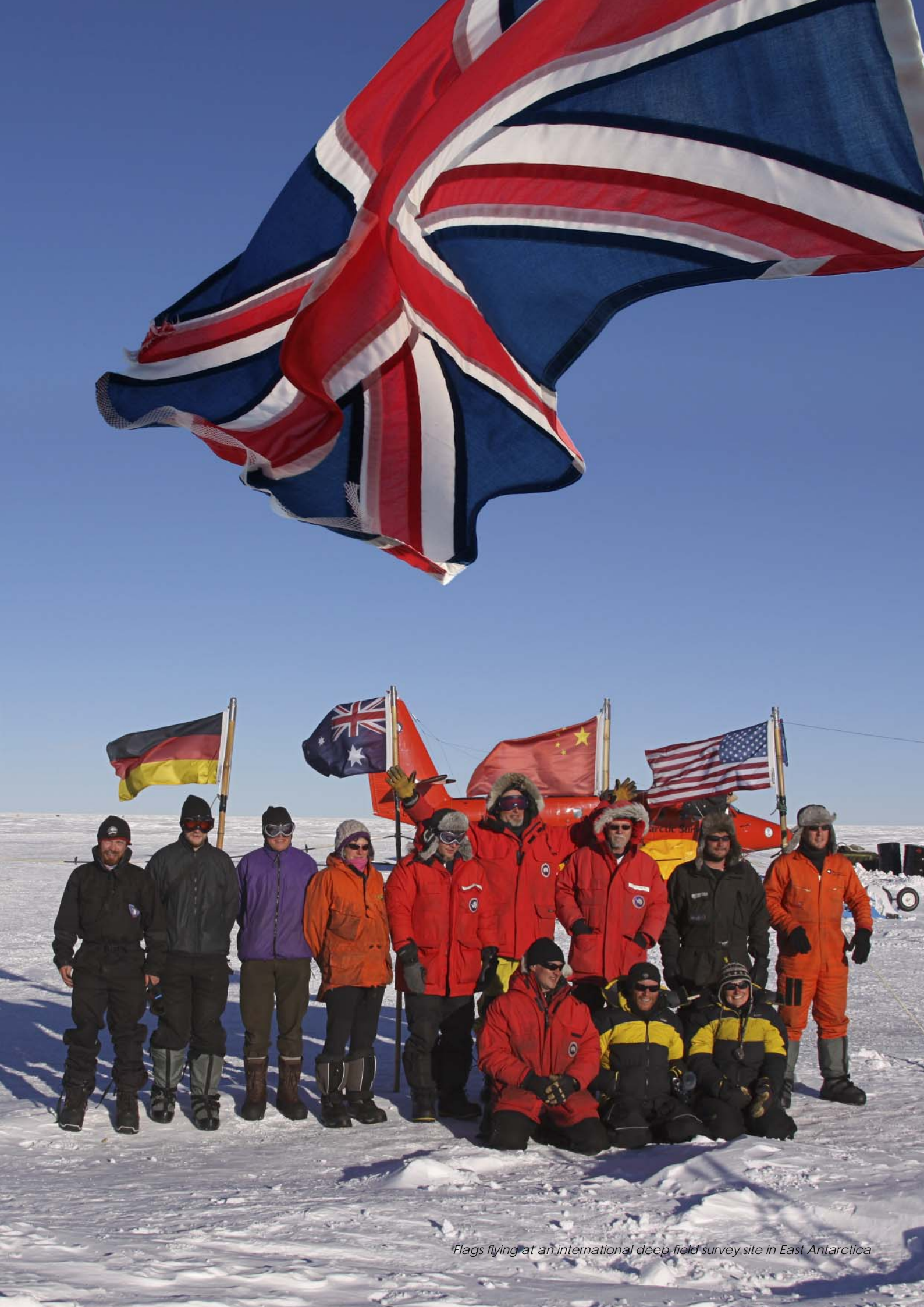
Flags flying at an international deep-field survey site in East Antarctica