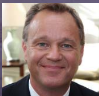
Mark Simmonds MP Parliamentary Under Secretary of State for Foreign and Commonwealth Affairs

Timelapse of meteorological balloon release at Halley Research Station, Antarctica