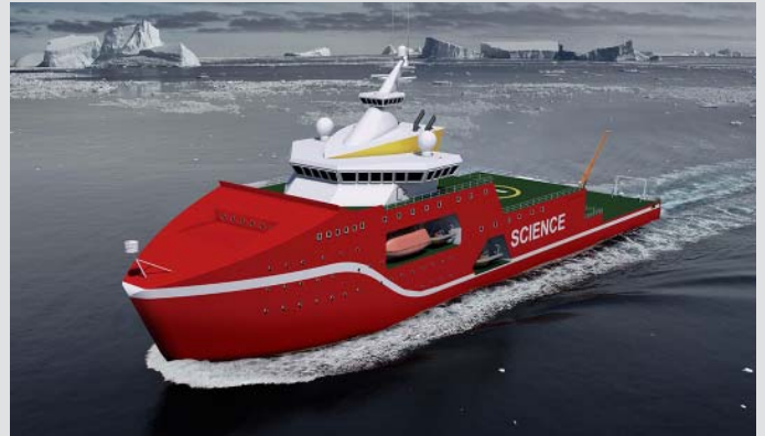
The new flagship for polar science (artist's visualisation)

A new polar marine vessel, to be in operation by 2019, will provide a world-leading platform to support complex multi-disciplinary scientific missions in the polar regions and provide logistic support to Antarctic research stations. This world-class, ice-strengthened research ship will have state-of-the-art laboratories, enhanced capabilities for sophisticated environmental monitoring, and facilities for the deployment and operation of remotely-operated and autonomous marine and airborne vehicles. The new vessel will maximise fuel and energy efficiency, have