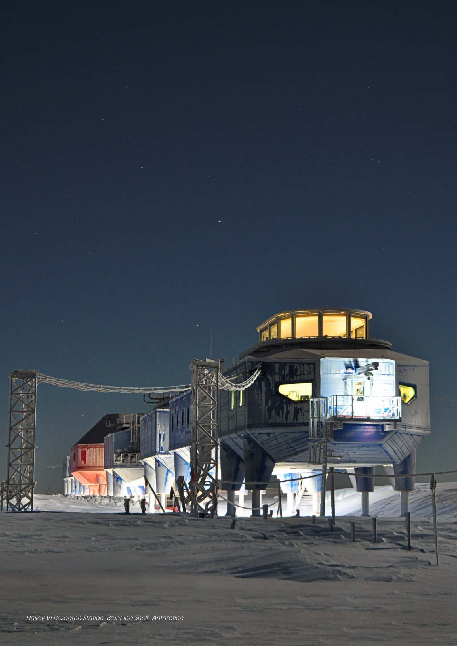
Halley VI Research Station, Brunt Ice Shelf, Antarctica