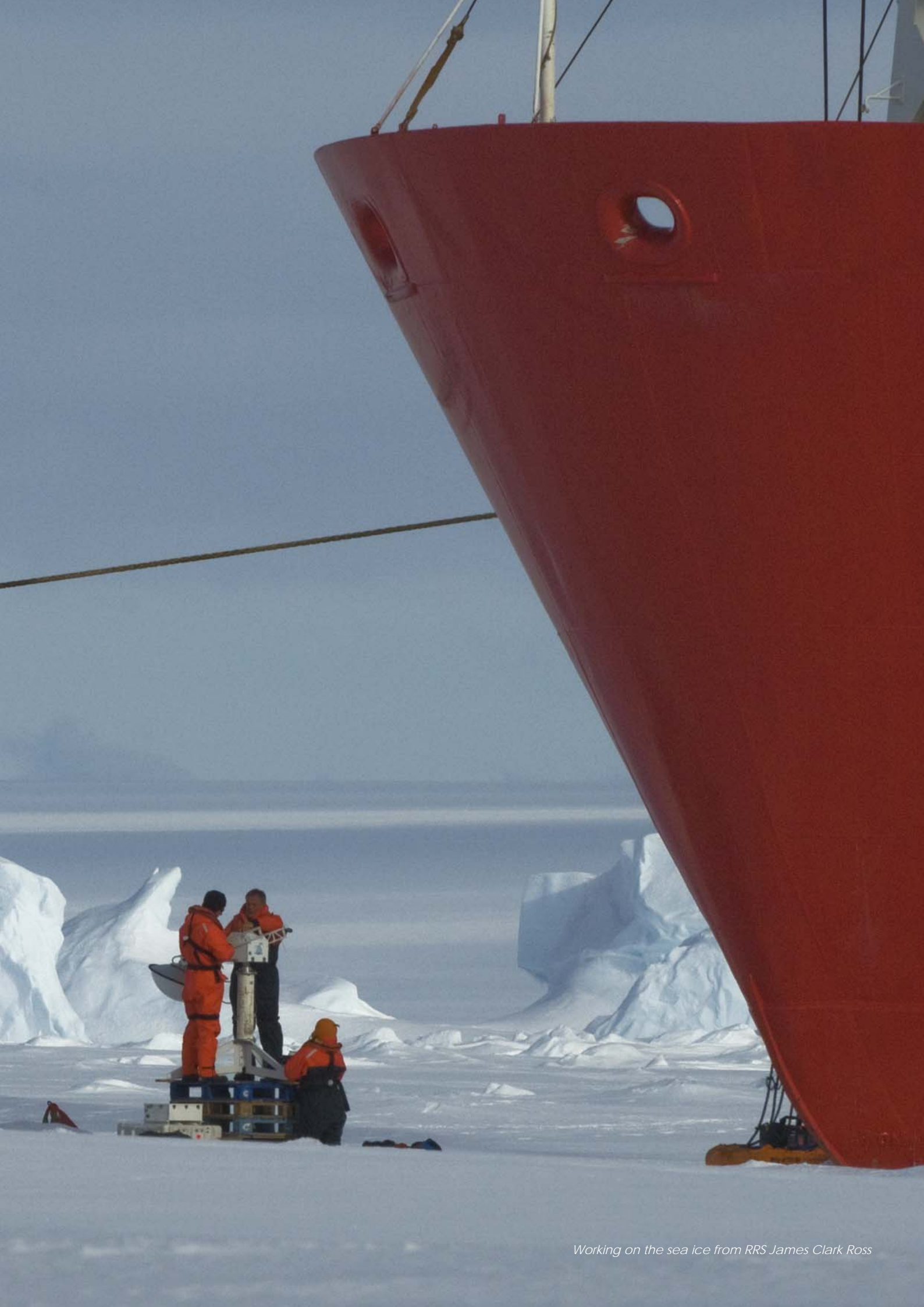
Working on the sea ice from RRS James Clark Ross