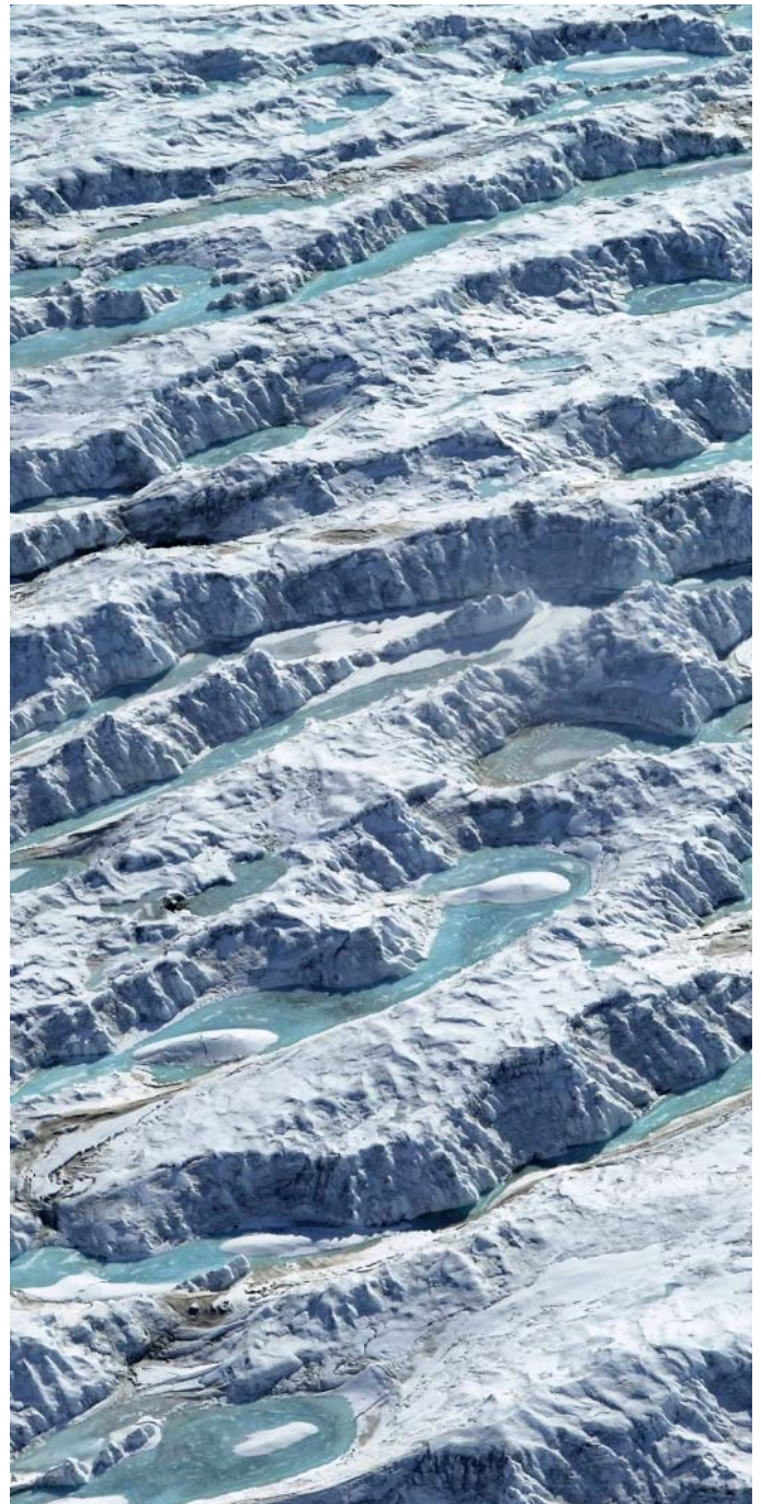
Melt pools on George VI Sound, Antarctica

Antarctica and the surrounding Southern Ocean play a key role in the global climate system. They exert important controls on global sea-level rise, atmospheric carbon dioxide concentrations and the transport of heat around the planet. The scientific evidence that the world's climate is changing is extensive and clear – and parts of the Polar Regions are warming much faster than most other regions. To refine our understanding of how the climate system works and how climate will change in the coming decades and centuries we must continue our investigative research. The UK polar community brings a broad range of scientific expertise to bear on research goals such as: