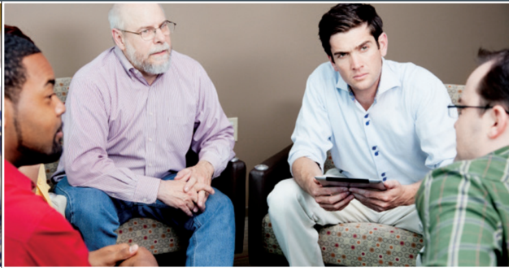
Proof that you are working to evidence-based standards