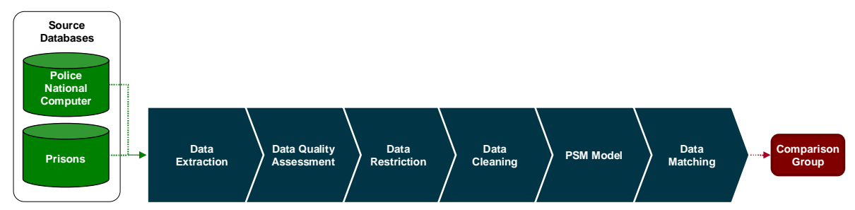
Figure 2.1: PSM methodology