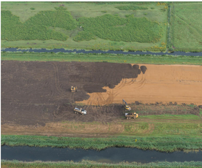
Top soiling Rings End to Poplar House Farm

All of the material has now been delivered and you will have noticed a significant reduction in lorry movements to this work area. 97% of all the material has now been placed with 80% trimmed and ready for top-soiling - of which 50% is complete. We are using the original topsoil that we stripped at the start of the works. From this, the bank is naturally self-seeding itself and we will be enhancing the grass coverage with a conventional grass seeding method, using a tractor and seed box.