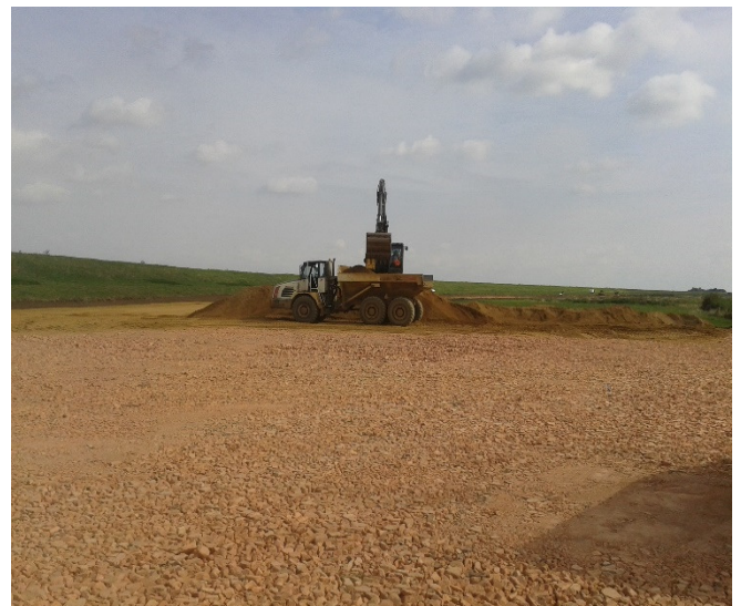
Material deliveries at St Peter's Farm

Work is progressing at two locations: between Bassenhally and St Peter's Farm and between St Peter's Farm and Poplar House Farm. This involves stripping topsoil, material deliveries and placement.