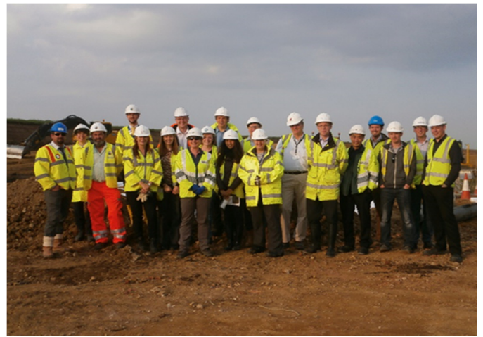
ICE/CIWEM Members site visit

On 3 September the site team hosted a visit by 20 members of the Chartered Institution of Water and Environmental Management (CIWEM) and the Institution of Civil Engineers (ICE). We gave a presentation about the project's background, design principles, challenges and construction stages at our contractor's Interserve Construction Ltd's site office. This was followed by a tour of the works area where our visitors had the opportunity to view the various stages of earthworks and ask questions. We received positive feedback from the visitors who enjoyed the event and learned many interesting facts about the locality, as well as technical matters.