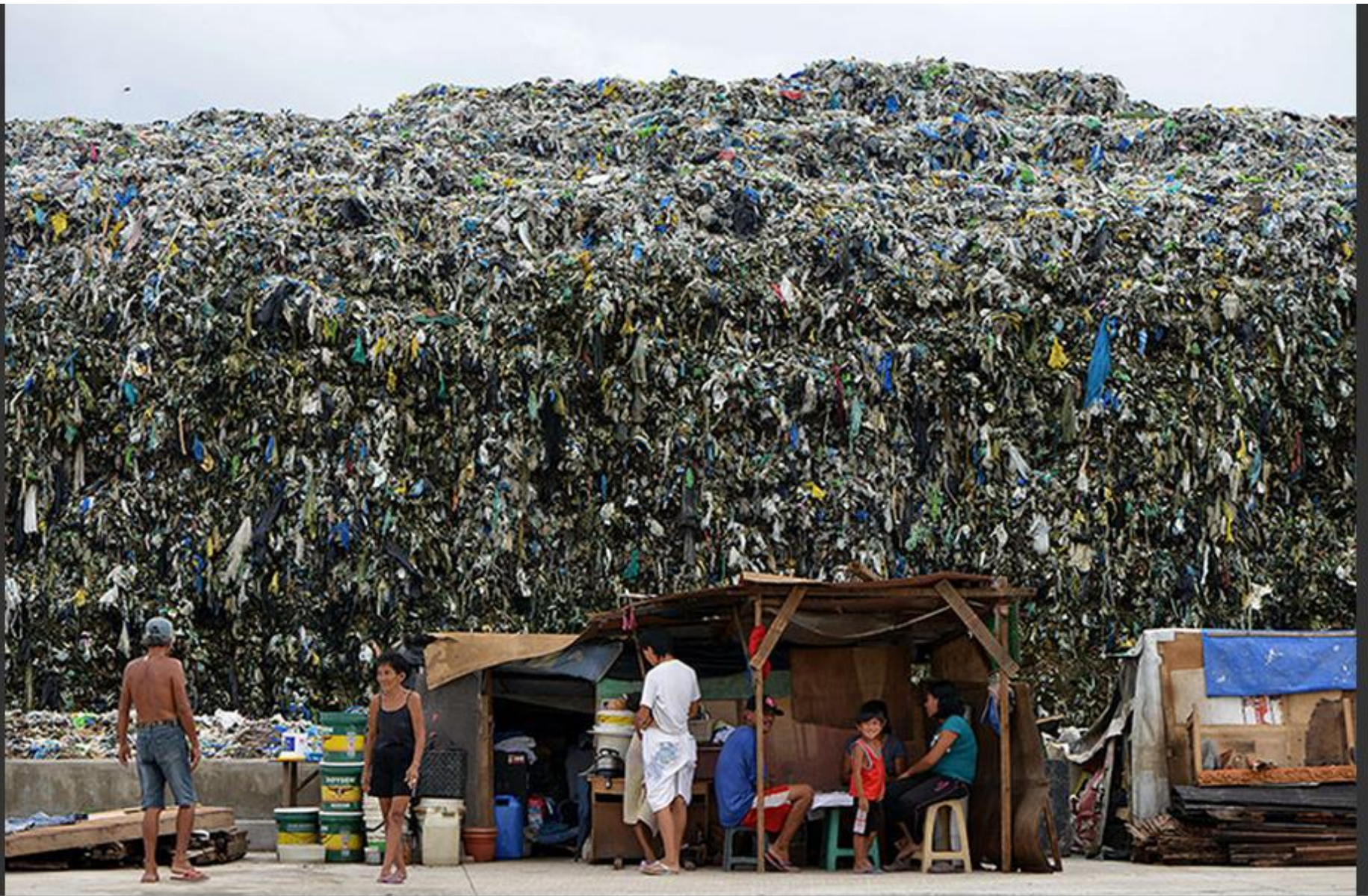
Waste towers over residents in Manila. The city has just banned disposable plastic shopping bags to curb the tide of rubbish in the city, which exacerbates its flooding problem