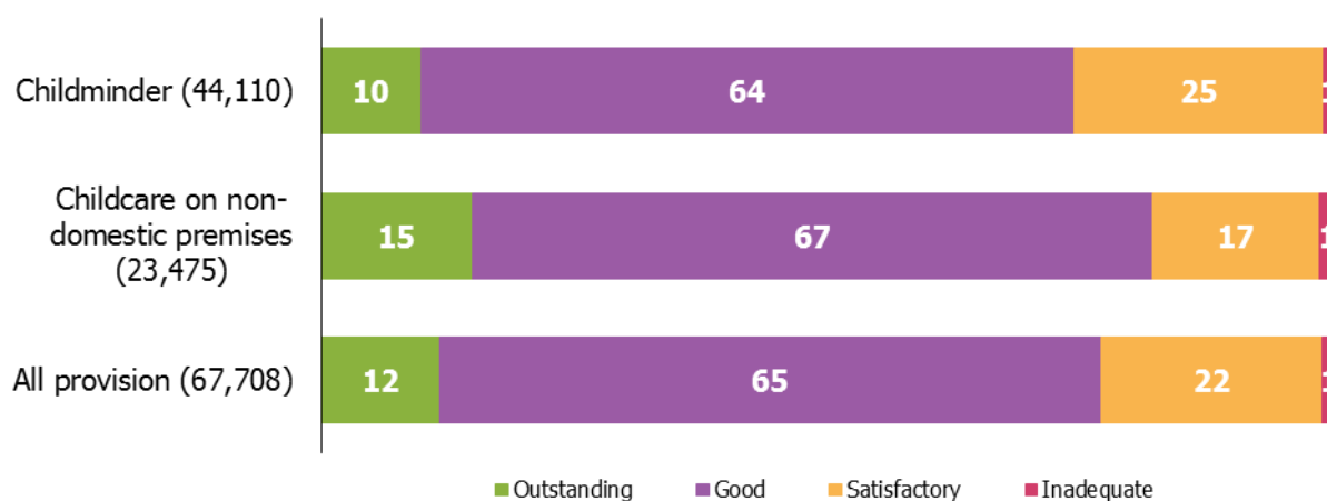
Chart 2: Overall effectiveness of active early years registered providers at their most recent inspection as at 30 June 2013, by provider type (provisional) 1 2 3