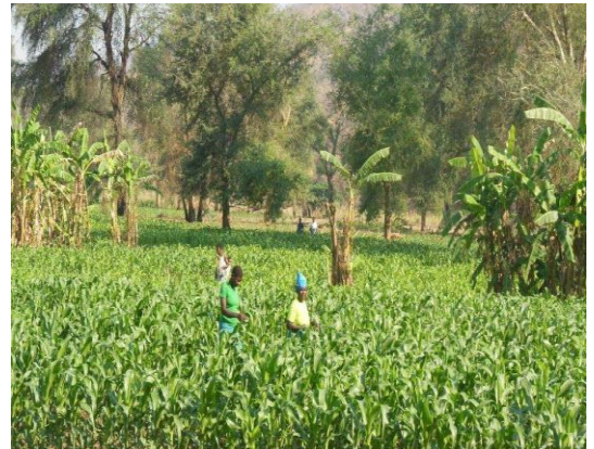
Improved harvests through better sustainable agriculture practices.

DFID's Enhancing Community Resilience Programme (ECRP) aims to enable households and communities to mitigate the effects of climate change through building the capacity of communities to anticipate, plan and respond to the changing environment, including droughts and floods. The programme includes small-scale irrigation, giving people access to irrigated farmland to supplement household food supply, and support to sustainable conservation agriculture practices leading to improved harvests. The programme also supports village savings and loans schemes that have helped vulnerable households to access cash for small investments to improve their financial security.