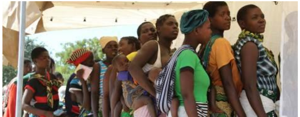
Women outside a health clinic registering for free family planning services.

33,000 people were supported with access to financial services by September 2014.