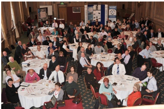
An event for neighbourhood planners held in July

The Council has commissioned Re'new Leeds to prepare Housing Market Assessments in areas where significant growth may take place, and the Leeds Core Strategy is expected to be adopted in November, proposing 70,000 new homes. Identifying sites for housing (as well as employment, retail and green space) will be something neighbourhood plans can contribute to.