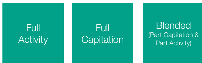
Figure 1 – Approaches to remuneration

This document looks at the benefits and challenges associated with each broad option informed by our learning from the dental contract pilots.