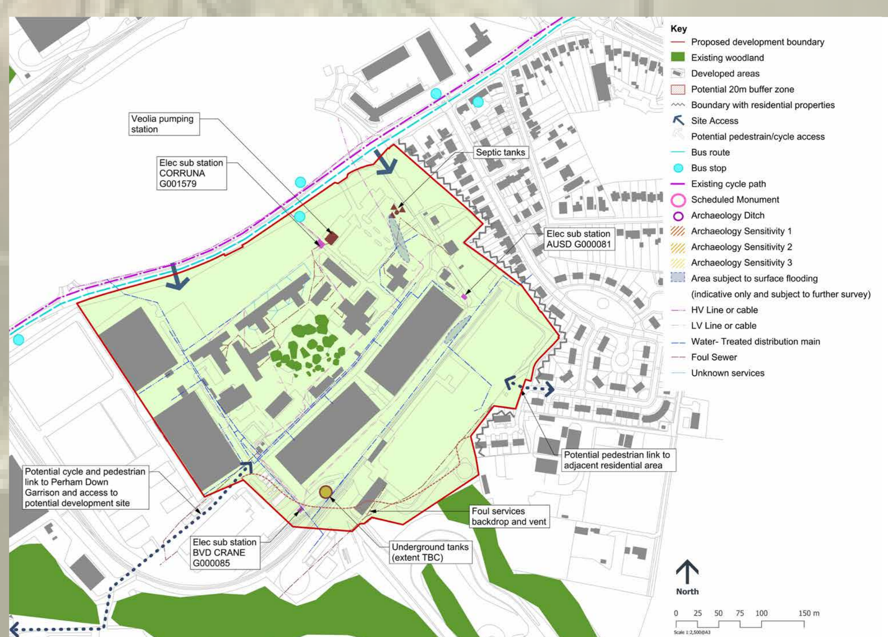
Constraints and Opportunities Plan