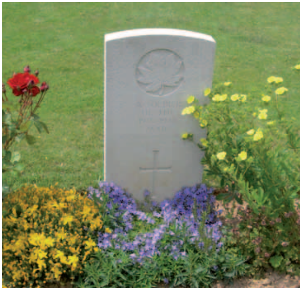
The grave of an unknown Canadian soldier at Bayeaux Commonwealth War Grave cemetery

Ahead of the 70 th Anniversary D-Day commemorations the CWGC's staff in Normandy have been working to prepare and renovate many of these important sites. This has included replacing more than 8,000 headstones to ensure the