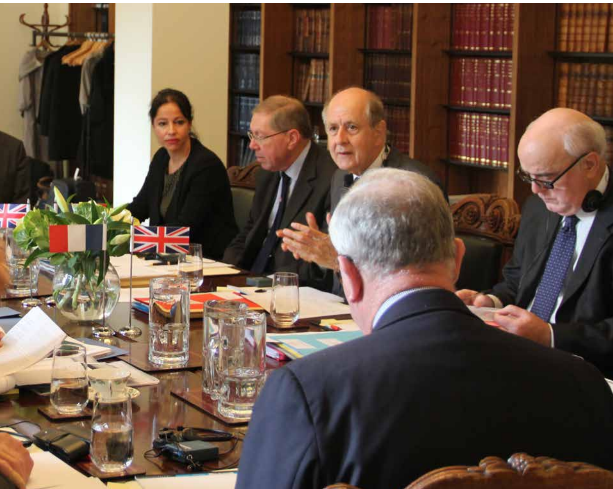
Above: Dean Spielmann, the President of the European Court of Human Rights, and Lord Neuberger (centre) surrounded by other members of both courts during discussions in March 2014.