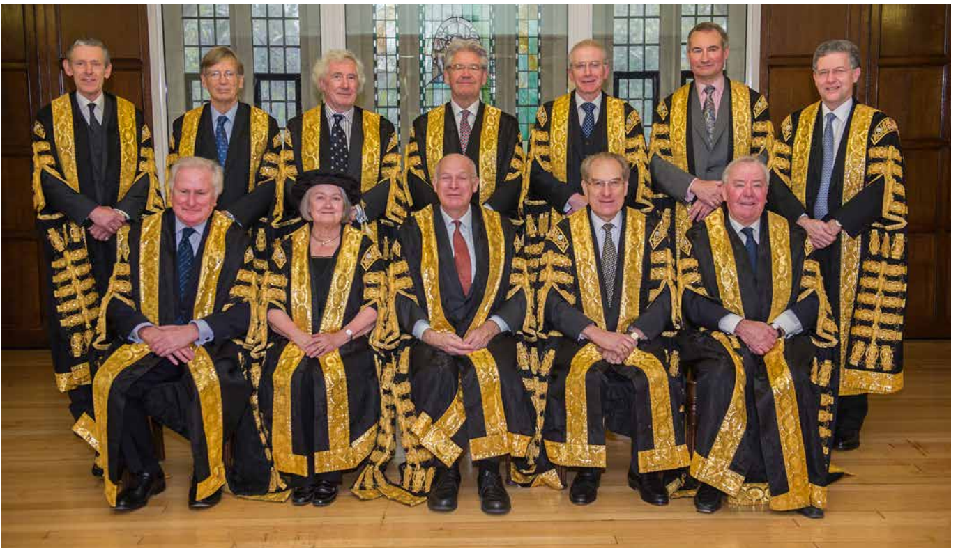
The Justices of the Supreme Court, pictured in December 2013

For the future, although the President will continue to be a member of, and chair all selection commissions other than those to select his/her successor, the Deputy President