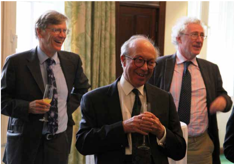
Lord Hope pictured with colleagues during a reception to mark his retirement

devolution, the changes to the House of Lords, the introduction of the Human Rights Convention into UK law, the development of EU law, and the formation of the Supreme Court. As the one member of the UK's top court during the lead up to and the implementation of all these changes, Lord Hope has had a profound influence on the development of the UK constitutional settlement into the twenty-first century." Lord Neuberger praised Lord Hope's "care, consideration and conscientiousness" across his many responsibilities, paying particular tribute to his service to the JCPC and in leading the former Law Lords' committee on the transition to the Supreme Court in 2009.