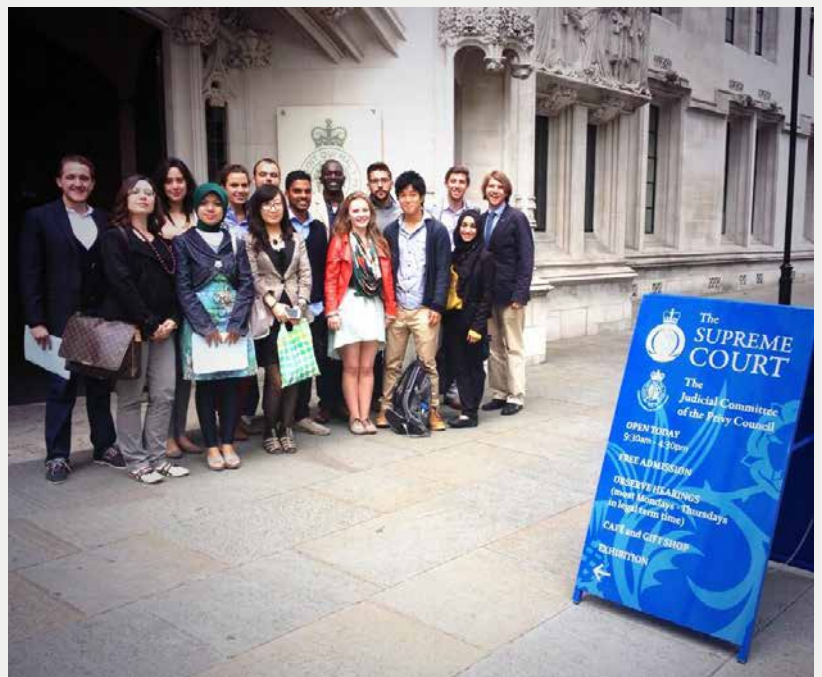
Youth Diplomatic Service