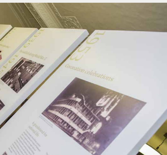
Left: Guests at the opening of the summer exhibition on the history of the Guildhall