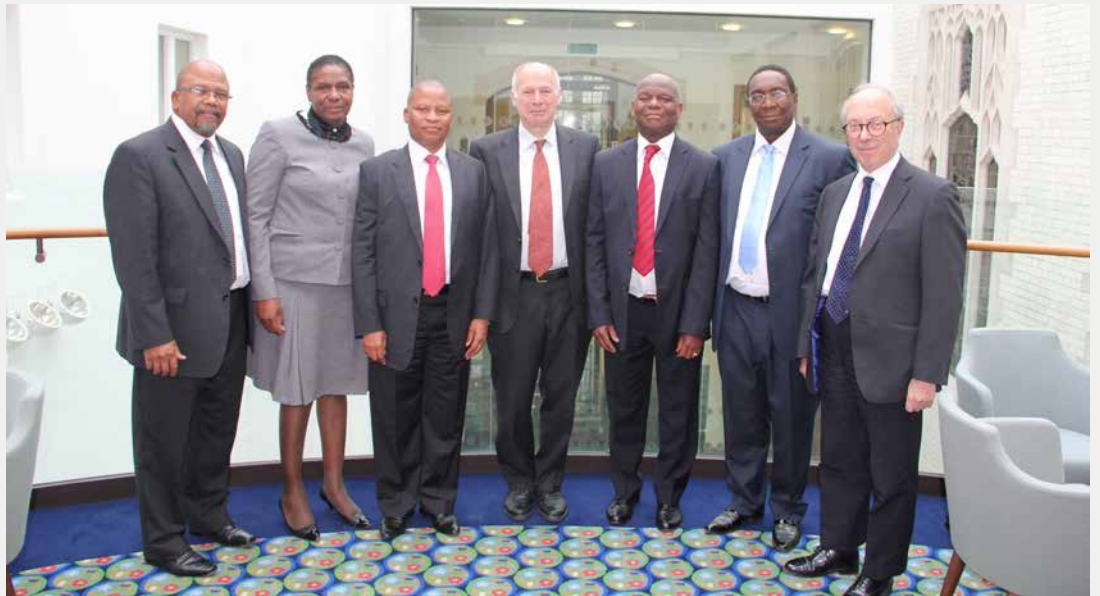
Above: Lord Neuberger (middle) and Lord Hope (far right) meet the Chief Justice of South Africa, The Hon Mr Justice M Mogoeng, and some of his colleagues during their visit to the Court, June 2013.