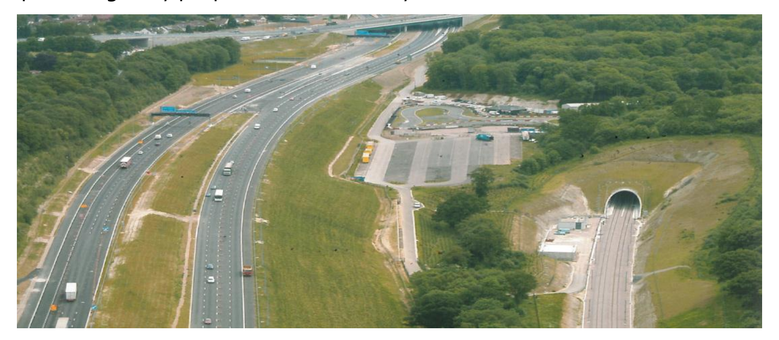
Access to Western portal of North Downs Tunnel taking account of go-cart track and scout camp.

• The formation, laying out or alteration of any means of access to a highway used or proposed highway proposed to be used by vehicular traffic.