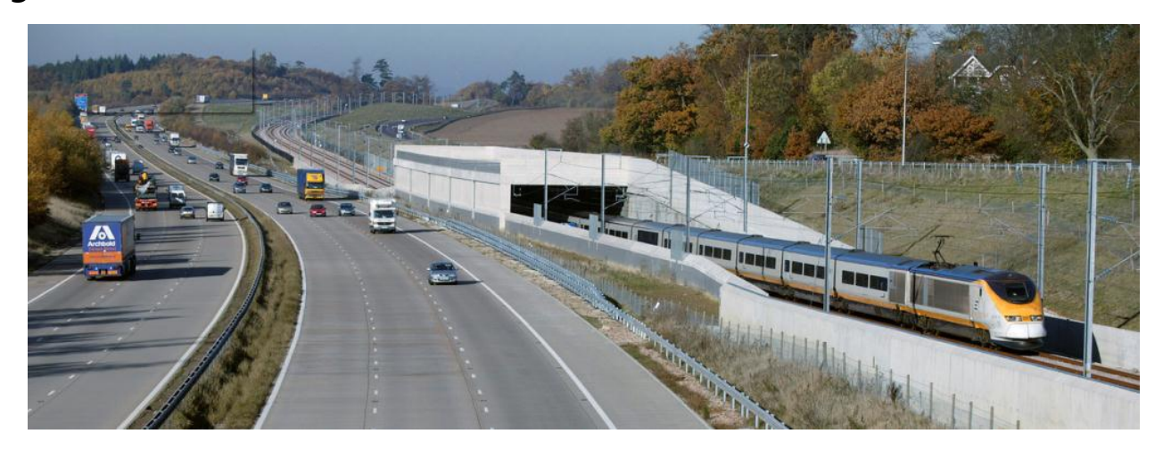
Harrietsham "tunnel", Maidstone