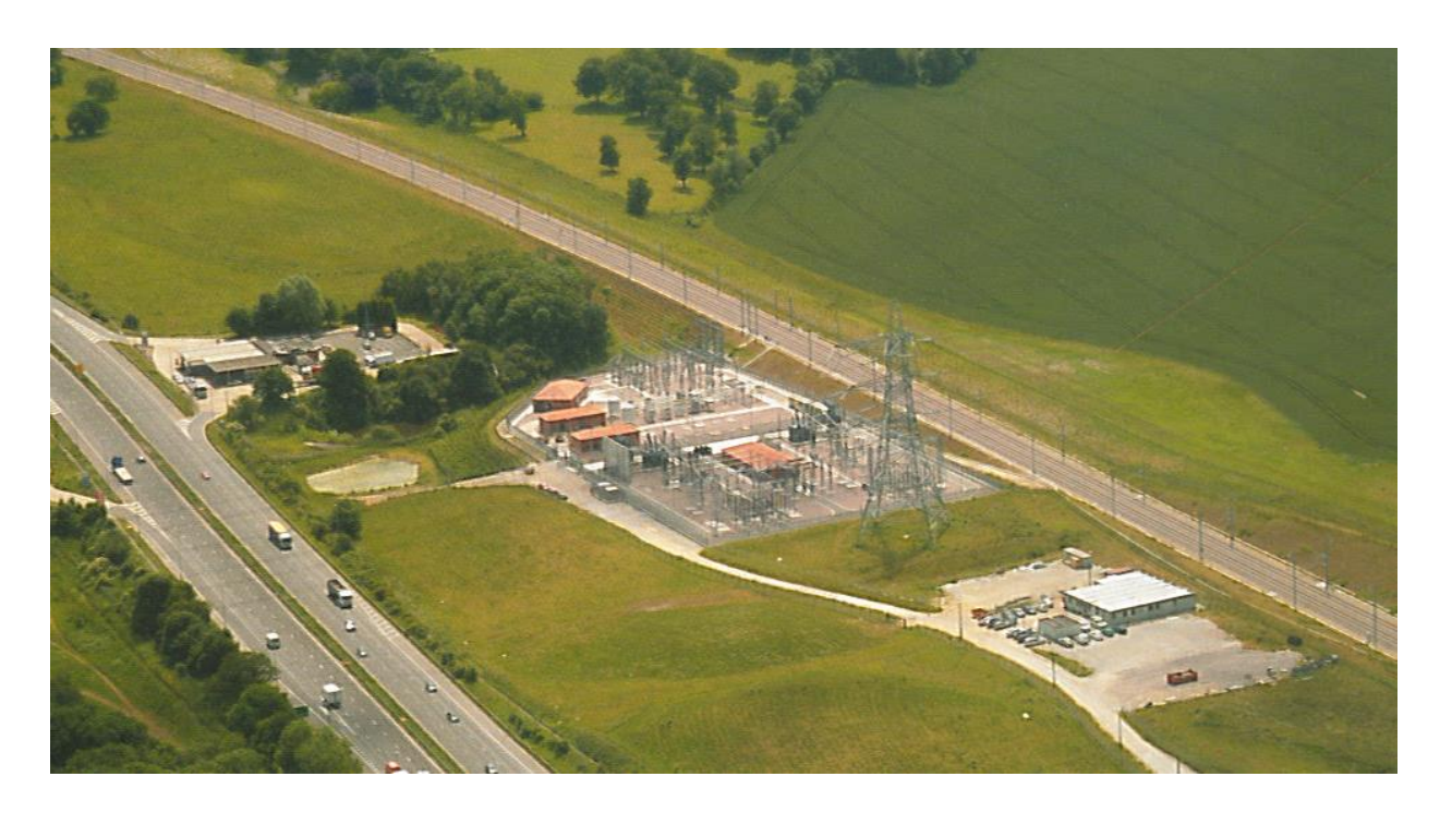
Singlewell Feeder Station

• The erection, construction or installation of lighting equipment.