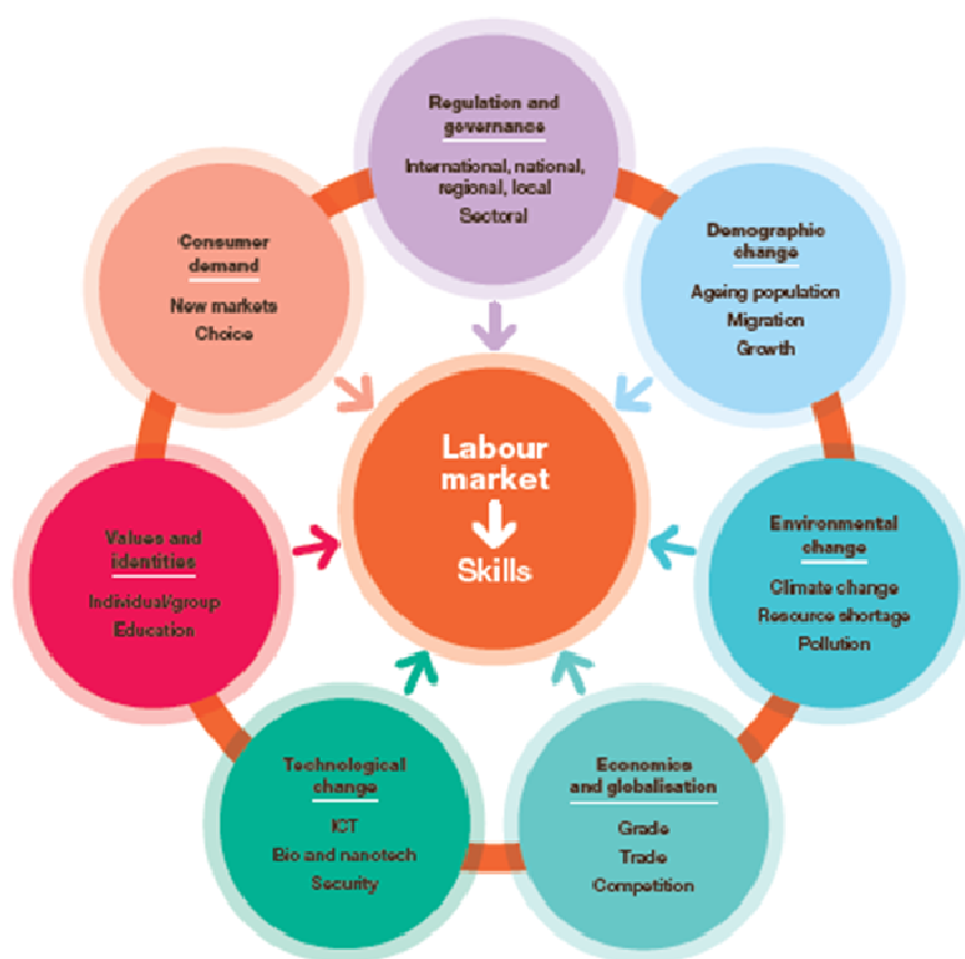
Figure 6.1: The major drivers of change