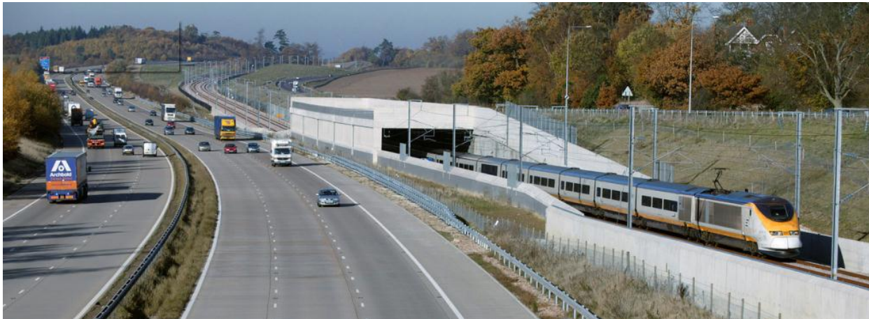
Harrietsham "tunnel", Maidstone