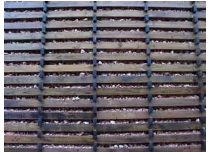
Crib Wall Repton Ponds