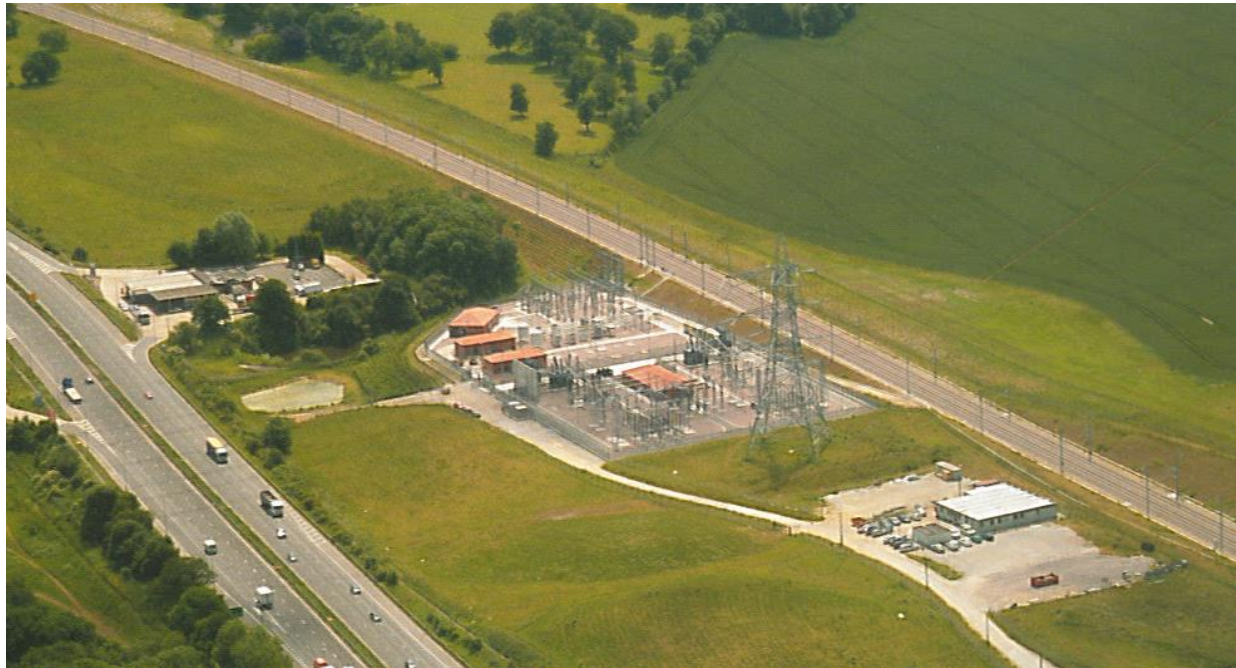
Singlewell Feeder Station