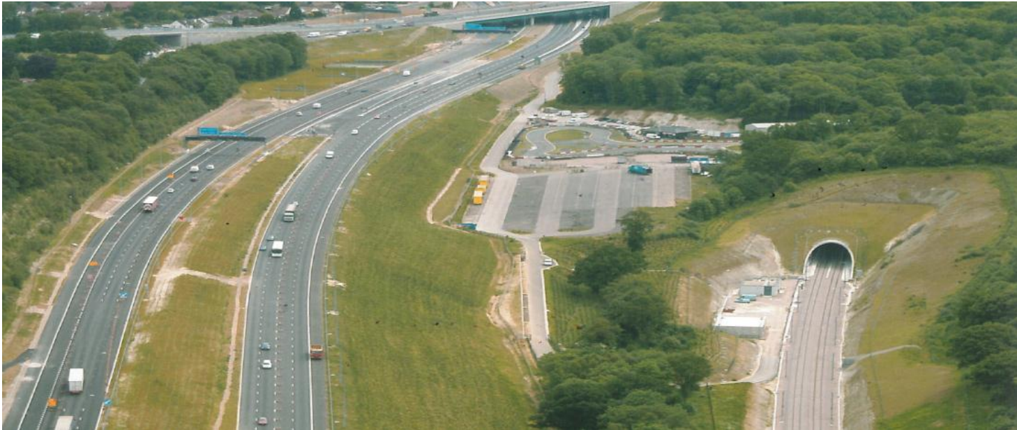
Access to Western portal of North Downs Tunnel taking account of go-cart track and scout camp.