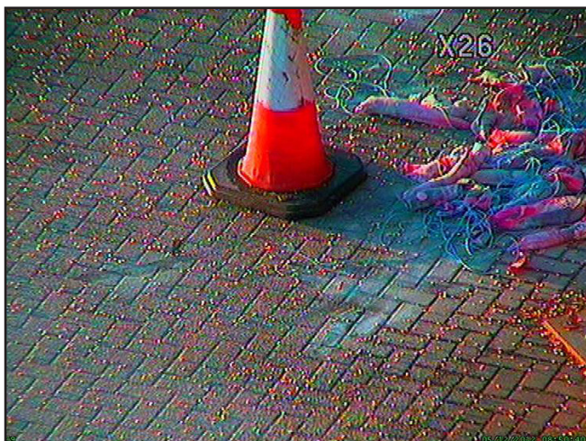
Figure 1: Fumigant retainers and spilled fumigant