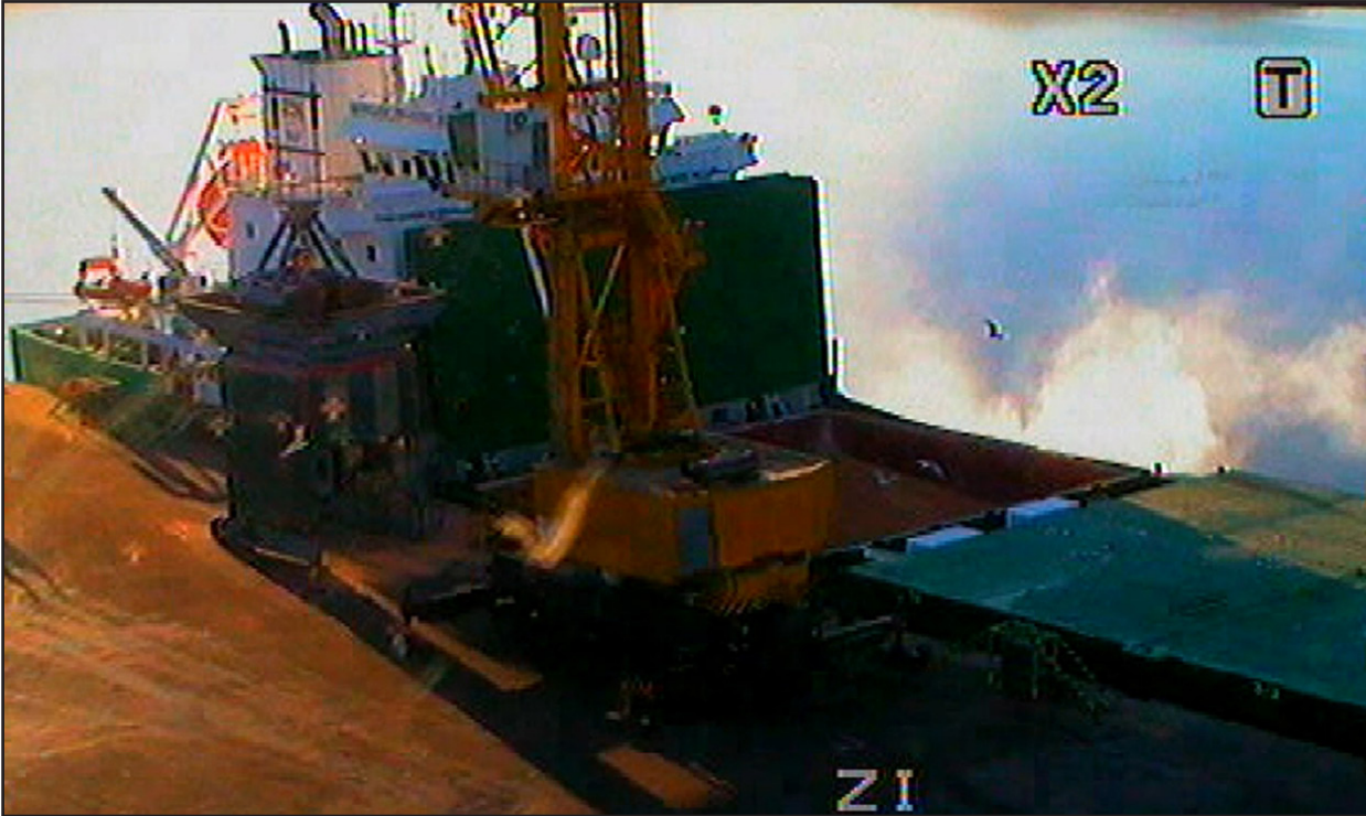
Arklow Meadow : smoke from fumigant residue during discharge of maize cargo