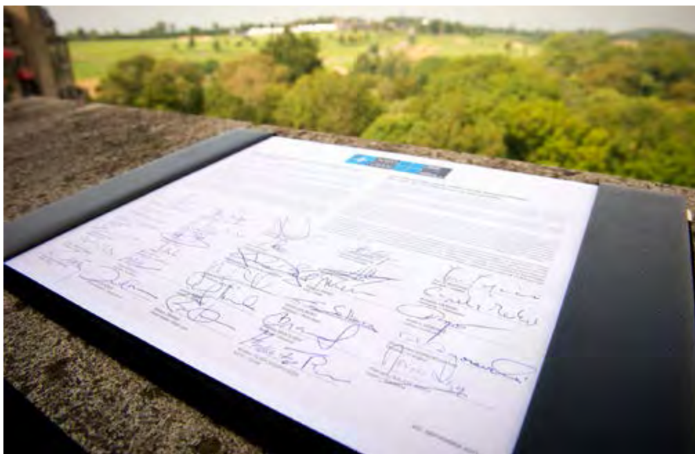
Picture of a signed copy of the NATO declaration

At the NATO Summit, held in Newport Wales on 4/5 September 2014, Heads of State and Government from all 28 Allies agreed an Armed Forces Declaration. The declaration reaffirmed support for the men and women serving in our Armed Forces and their families, during and after their service, now and in the future, given the immense sacrifices they make. It committed Allies to enhance the sharing of best practices and lessons learned in support of our Armed Forces personnel and their families, including on our national approaches to providing medical care to injured personnel and support to families.