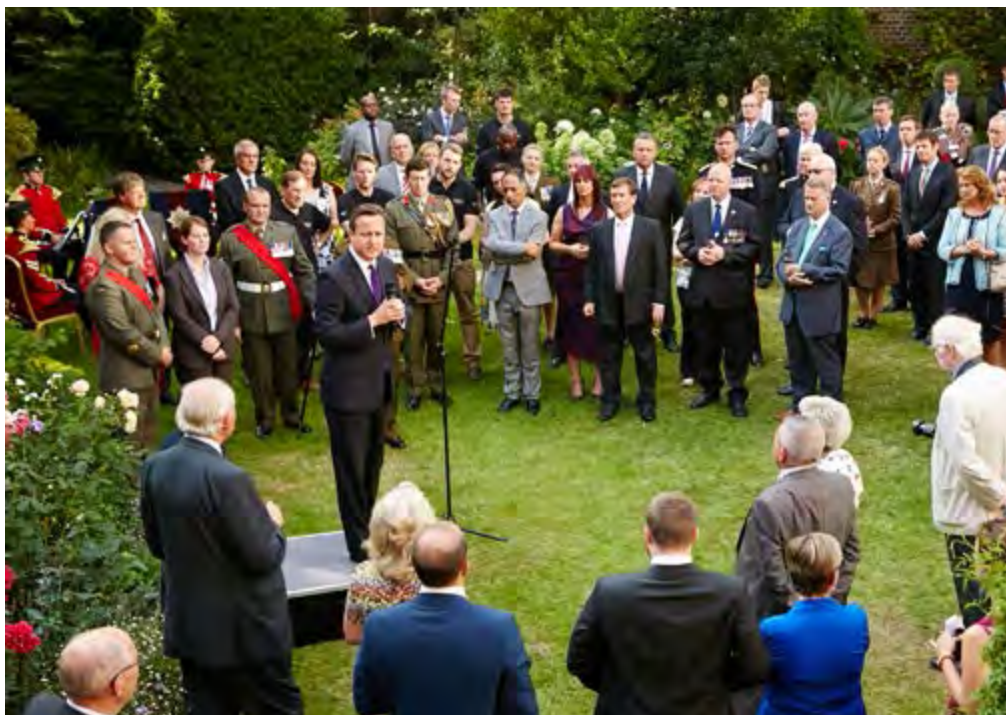
The Prime Minister speaking at the Armed Forces Covenant Celebration on 17 July 2014

Looking to the future, the MOD is considering how the new annual £10M fund can be managed to best support the commitments of the covenant. The intention is to put in place a sustainable solution that can support the commitments of the covenant in the longer term. The Covenant Reference Group is also discussing future priorities for the fund.