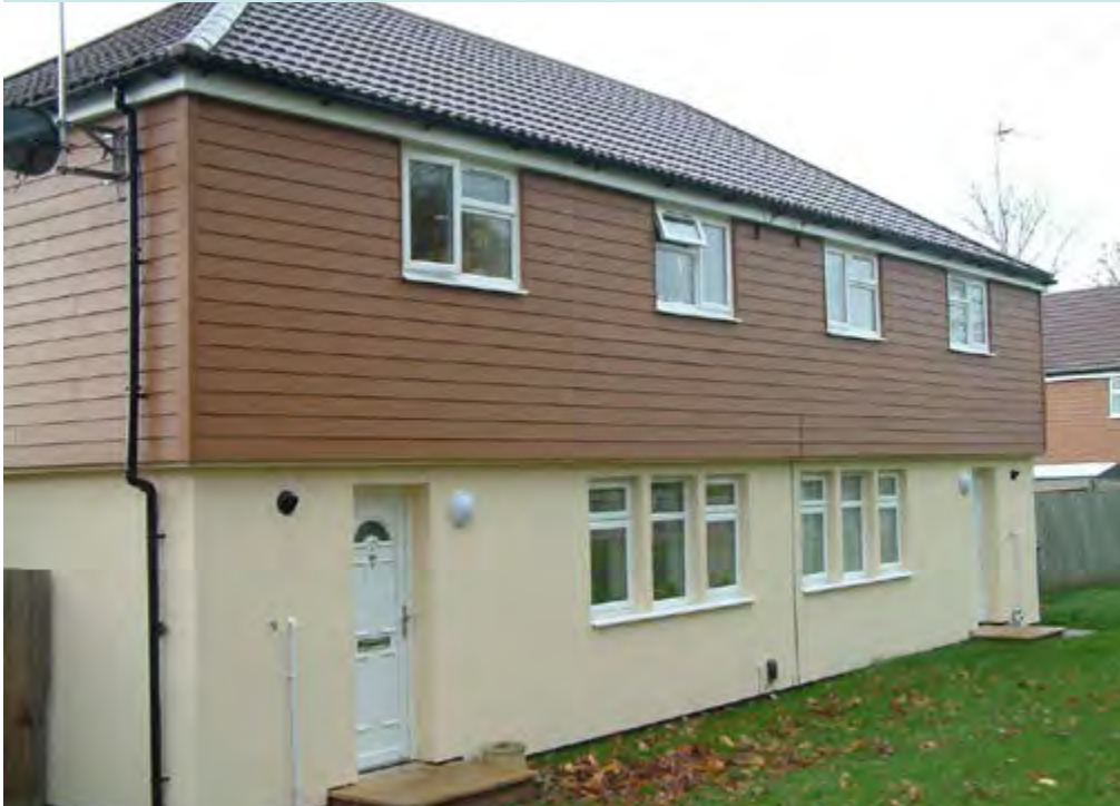
Sgt Bennett's refurbished property

It is an improvement on our last one. As well as being much warmer and cosier, the damp and mould issues are now a thing of the past. And because it is newer with neutral decoration, it is easier to maintain and look after. Plus we've also been able to put our stamp on it and make it our own. We take more pride in the appearance of our new property and as a consequence it feels more like 'home'. The property heats up more quickly than our last property and it stays warmer for longer. We haven't noticed any reduction in the amount of energy that we use so far as we haven't been in for very long and we've had some lovely warm weather, but I'm sure we'll notice a difference as winter draws in. Another thing we've noticed is that there is very little noise from traffic."