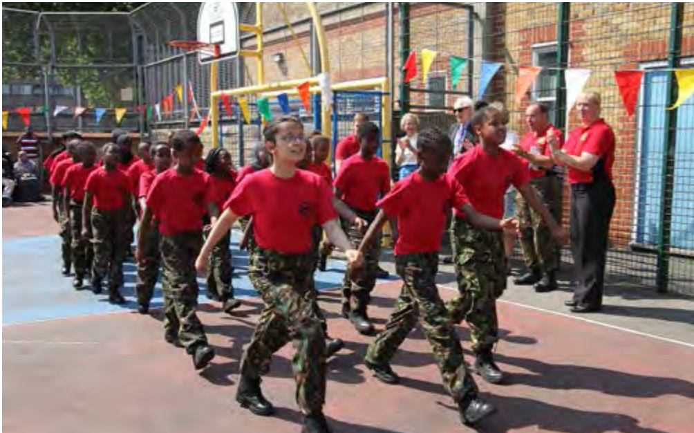
Working together: children on Challenger Troop's Military Ethos Alternative Provision programme

The National Youth Work Strategy for Wales (2014-2018) aims to elevate the status of youth work as both a service and a profession. The Council for Wales of Voluntary Youth Services (CWVYS) provides the Welsh Government with advice on how existing activities and structures can be aligned best with the unique contribution of uniformed youth work organisations in Wales. Welsh Ministers are encouraging Local Authority Education Departments to work with cadet organisations in the context of the Strategy.