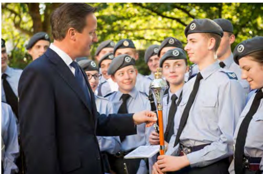
Members of the National Marching band of the Air Cadet Organisation at the No 10 event, on 18 June 2014

The Cadet Expansion Programme (CEP) is making significant progress following the Prime Minister's and Deputy Prime Minister's announcement in June 2012, that 100 new cadet units would be established in state-funded schools in England by September 2015. This programme is on track, with 61 new units established and over 100 more in the pipeline. To financially assist schools who join the programme, the Cadet Bursary Scheme has been established to provide financial assistance in these state schools. This was spear-headed by a Department for Education led fundraising event on 18 June 2014, at Number 10 Downing Street, which was supported by members of the Cadet Forces, where it was announced that £1M of LIBOR funding had been allocated to the scheme..