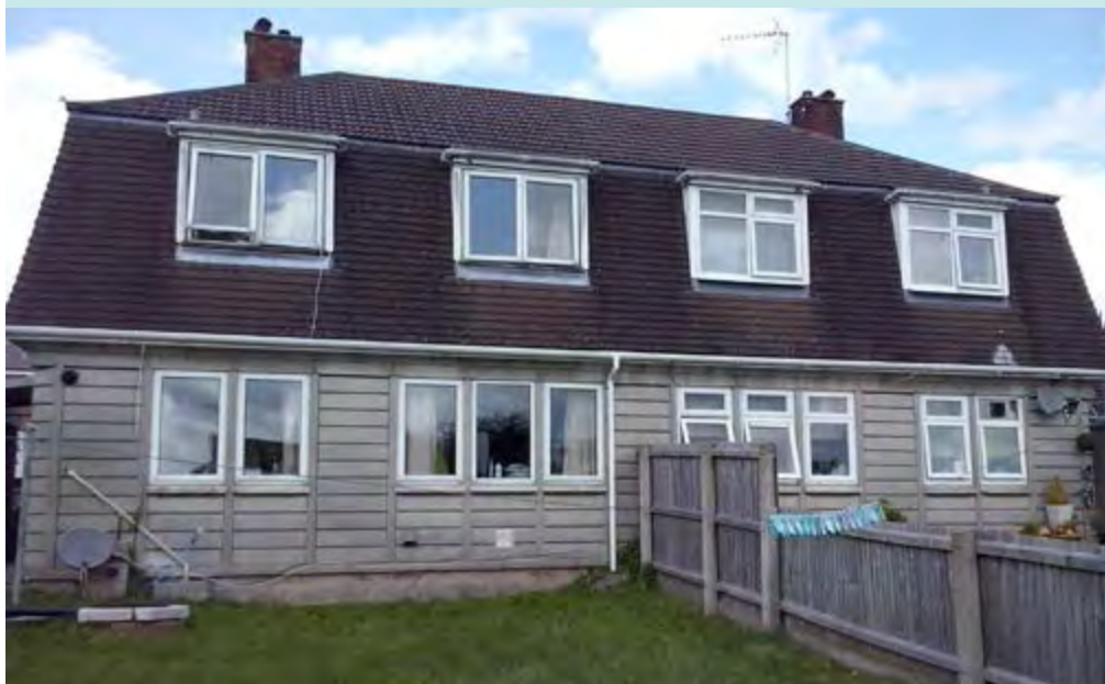
A similar unrefurbished property on the same estate

The family originally occupied a different, unrefurbished property in the area before moving around the corner to a refurbished one in August 2014. The new property is one of 62 being improved in the estate, and is part of DIO's Mould Action Plan. In financial year 2013/14 this programme targeted 1,063 properties that had a history of damp and mould, and is targeting a further 1,700 in 2014/15. The plan was established to address the issue which is seen as the prevalent maintenance concern of Service personnel and their families. The programme also aims to improve energy efficiency, and therefore comfort and expenditure on energy, for families.