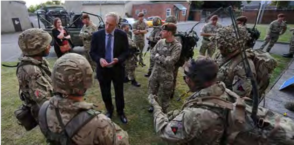
Minister for Reserves, Julian Brazier meets reservists during visit to The Royal Wessex Yeomanry

our web-based portal for Reservists who feel they have been disadvantaged when seeking employment.