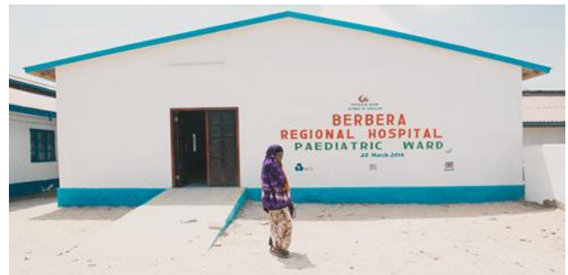
A paediatric ward in Berbera region supported by the UK.

As part of the UK cross-government team, we work with like-minded governments and other partners, such as NGOs, in support of a coherent international approach to political, development and humanitarian issues. We will continue to offer leadership in the international community to reshape the partnership with the Federal Government of Somalia through the implementation of the New Deal Compact.