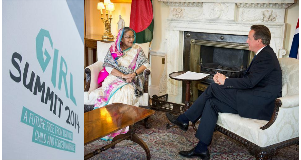
Prime Minister David Cameron meets Prime Minister Sheikh Hasina, July 2014 during the Girl Summit.