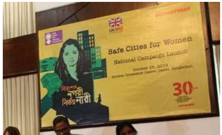
Launch of the Action Aid Safer Cities for Women campaign.

"We are working hard to make sure that girls stay safe in their homes and communities, and that they can claim their right to a secure and happy childhood, and a life free from violence and poverty. Only by working together will we be able to make the elimination of violence against women and girls a reality in Bangladesh and around the world."