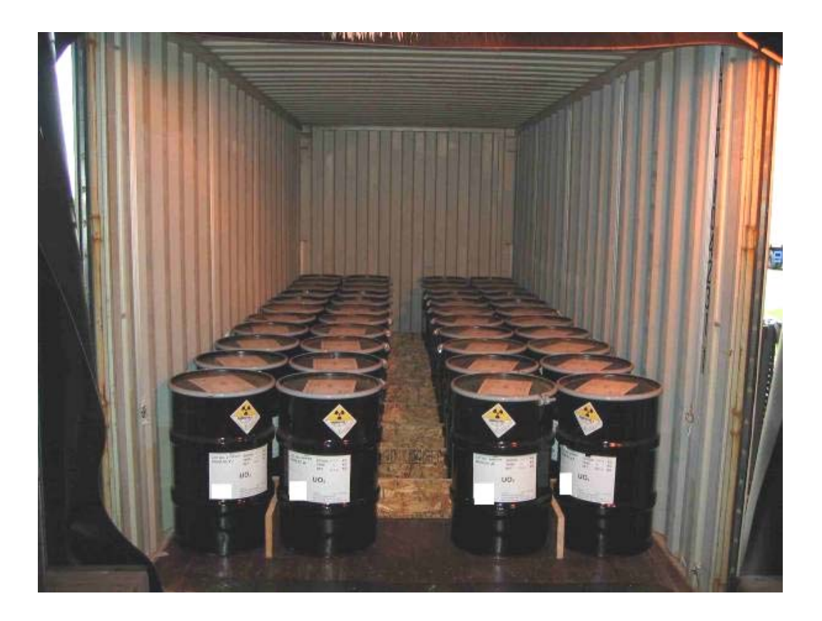
Figure 2. Drums of UO<sub>3</sub> inside a freight container

On arrival in the UK, after being placed on the quayside, the containers are taken by mobile "straddle carrier" cranes to a marked area of the dockside designated for radioactive materials. The containers are subsequently transported from the port to the fuel fabrication plant by road.