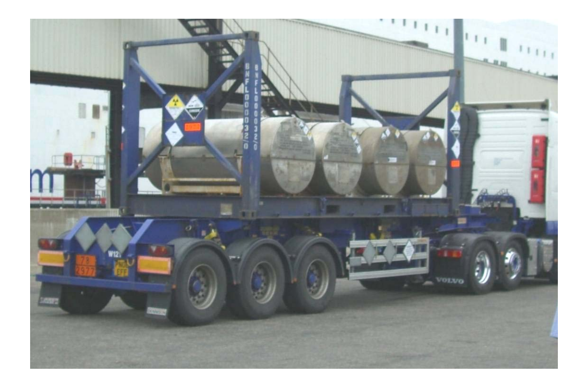
Figure 7. Four 30B cylinders containing enriched UF<sub>6</sub> fixed within a flatrack

container ship, are very similar to those described in Section 2.2.2 for consignments of 48Y cylinders.