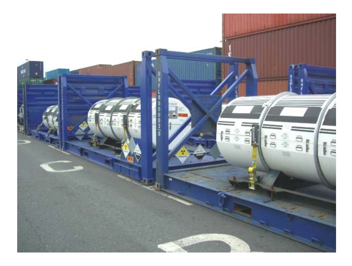
Figure 6. Natural UF<sub>6</sub> in 48Y cylinders fixed within flatracks in a dockside storage area

The flatracks are then taken by straddle carriers (Figure 5) to a designated area of the dockside for temporary storage (Figure 6). They are then taken by straddle carrier to be loaded onto lorries for onward transport by road.