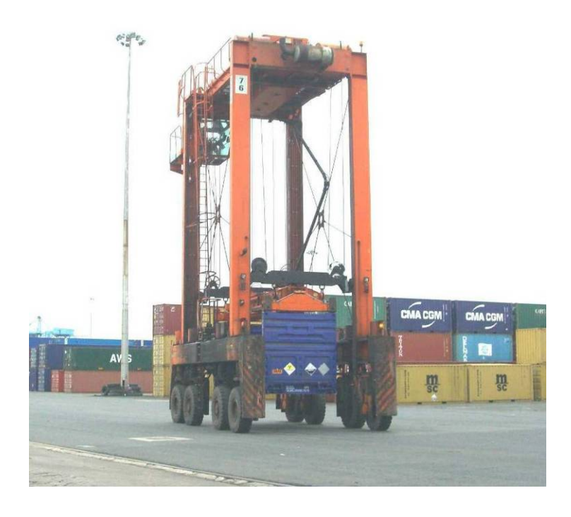
Figure 5. Transport of flatracks and containers in a port area by straddle carrier