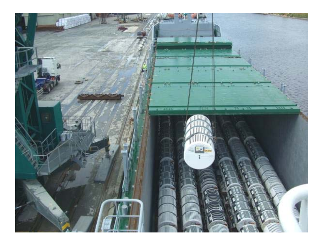
Figure 8. Loading of cylinders of depleted UF_6 into the hold of a ship