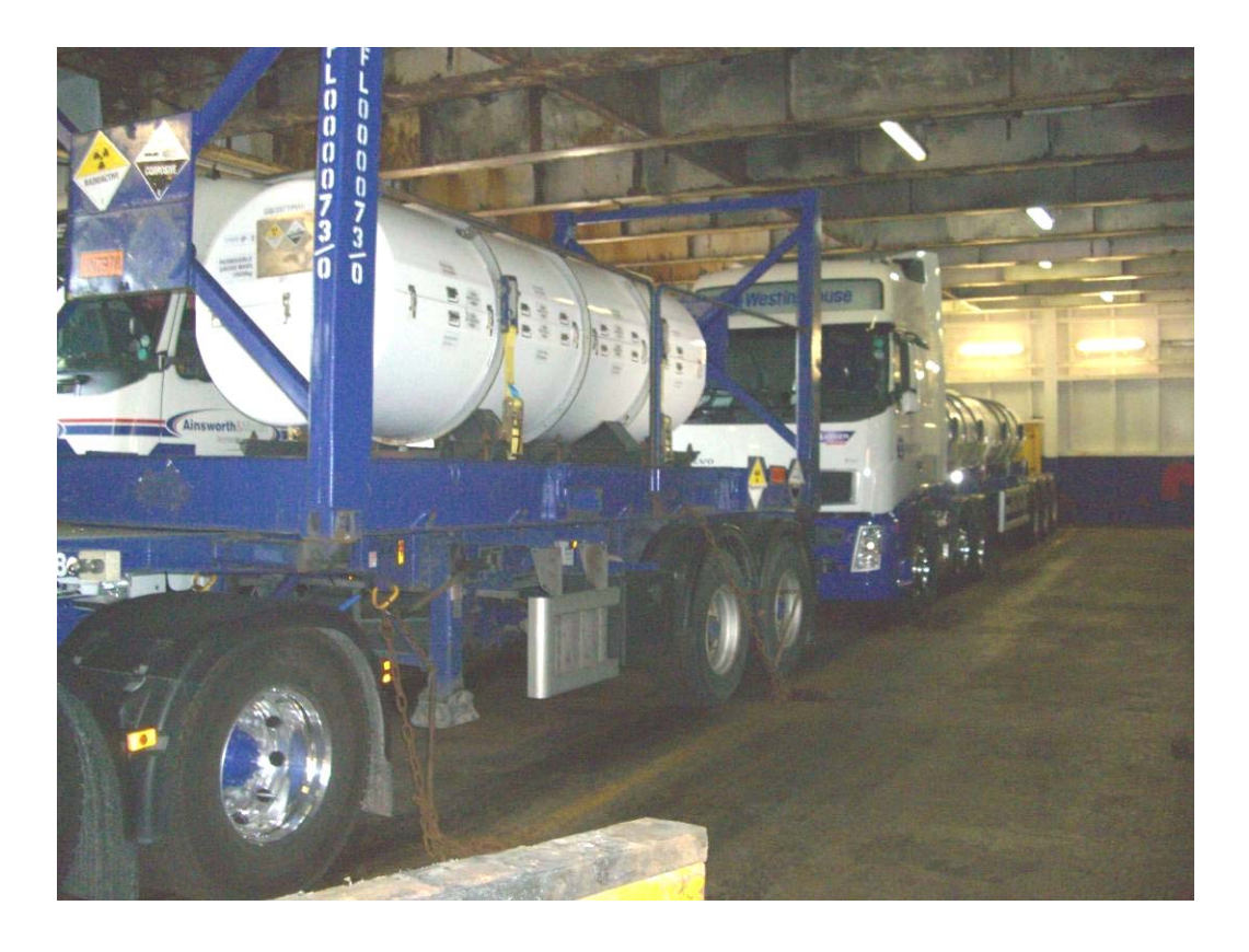
Figure 3. Lorries carrying 48Y cylinders of natural UF<sub>6</sub> on the vehicle deck of a freight ferry

Empty cylinders are returned to the uranium oxide/ hexafluoride conversion plant which can contain deposits of UF_6 called "heels". However, it should be noted that most of the cylinders encountered during this study were from facilities that periodically clean the internal surfaces. These "heeled" cylinders typically have dose rates at least an order of magnitude below those of full cylinders and are not considered further in this study, since their transport contributes a negligible dose to transport workers. Data on the number of these cylinders shipped by sea are included in Table 1.