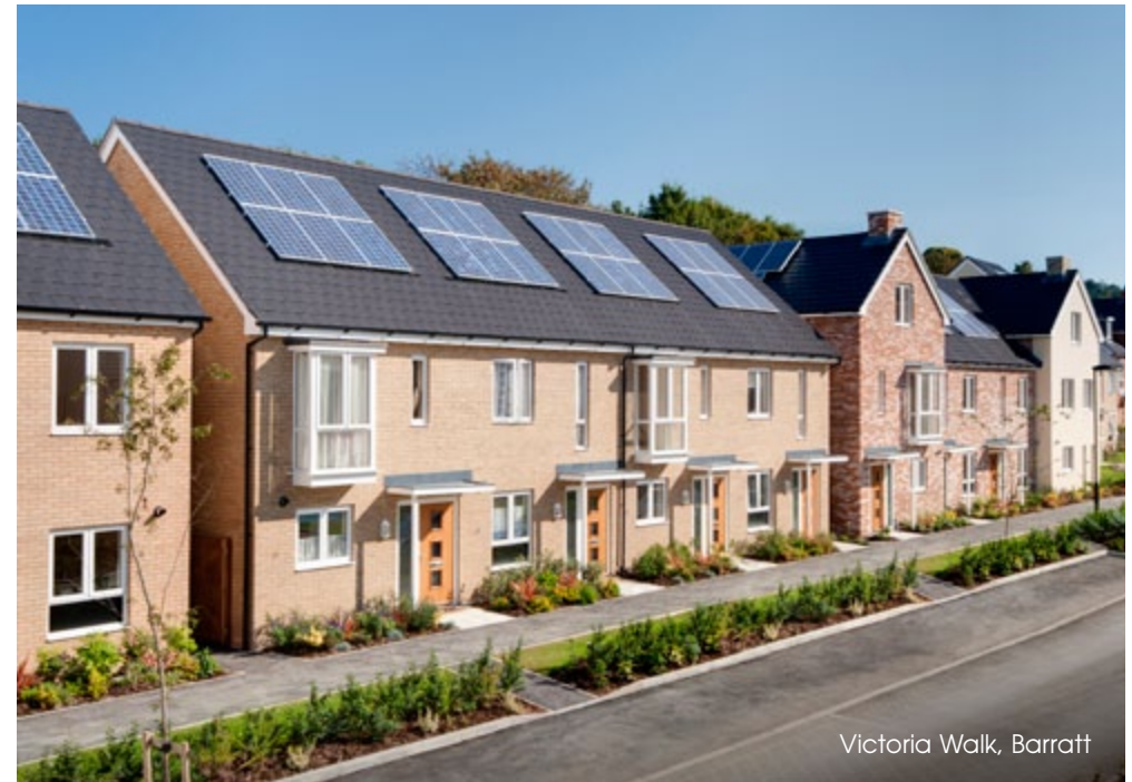
Victoria Walk, Barratt

A list of those bodies able to use the Panel is available at: www.homesandcommunities.co.uk/sites/default/files/our-work/potential_users_of_dpp2.pdf