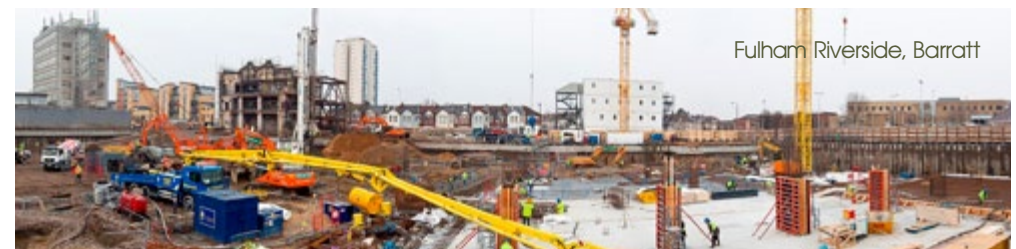
Fulham Riverside, Barratt