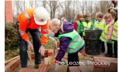
The Leazes, Throckley

Public bodies wishing to procure through the Panel will need to sign up to an access agreement with the HCA, ensuring that they take responsibility for their procurement. HCA will then provide the Partner with access to its e-tendering system, which holds all information necessary to enable them to use the Panel. Help, information, guidance and support to Partners in their use of the Panel is available if required.