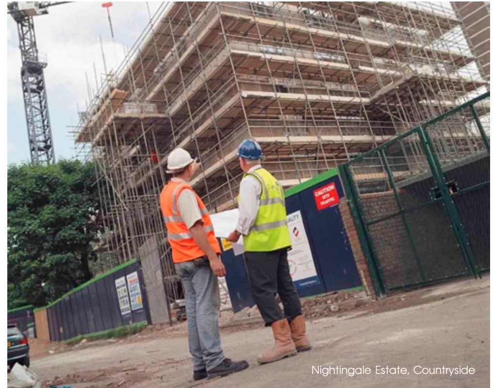
Nightingale Estate, Countryside