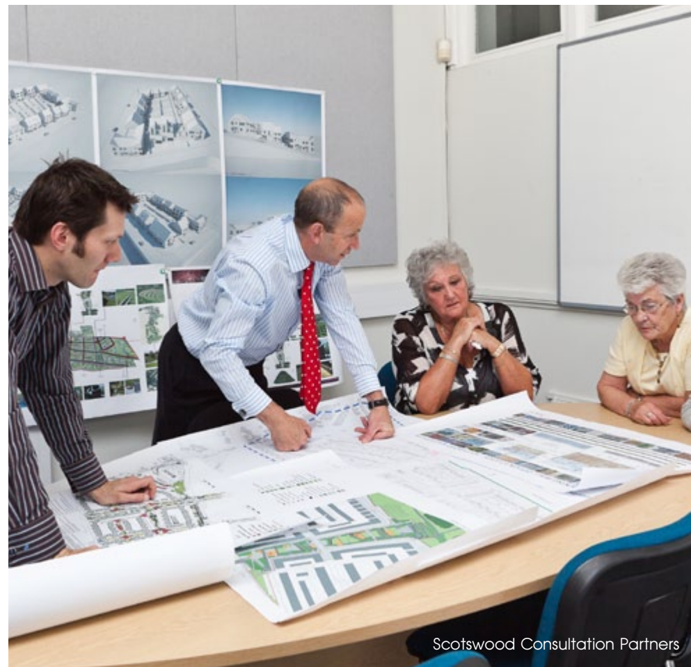
Scotswood Consultation Partners