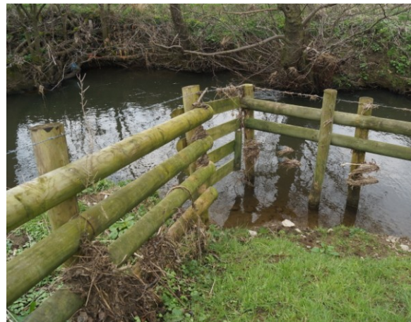
An example of improvement work – a dedicated cattle drinking point

The Derbyshire Derwent farming group met for the first time in January 2015 and includes representatives from: Environment Agency, Derbyshire Wildlife Trust, NFU East Midlands Region, L A Sharpe Ltd, Natural England, National Trust, Severn Trent Water, Old Waltonians Fishing Club, Chatsworth, Matlock Angling club and Derwent FFC.