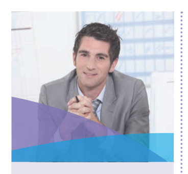
If you do not like negotiating or you are not a skilled negotiator, find someone who is good at it.

Unless you have a realistic idea of the scope of the licence and the worth of the IP before you start to negotiate, the negotiations are likely to be time consuming, and may flounder.