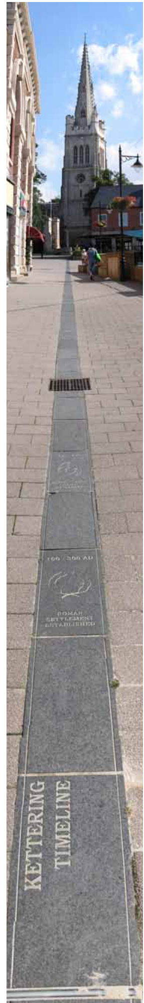
THE TIMELINE - KETTERING

The pictures of street scenes in this annual report have been used to give a pictorial representation of Northamptonshire and are not directly connected with the work of the MAPPA.