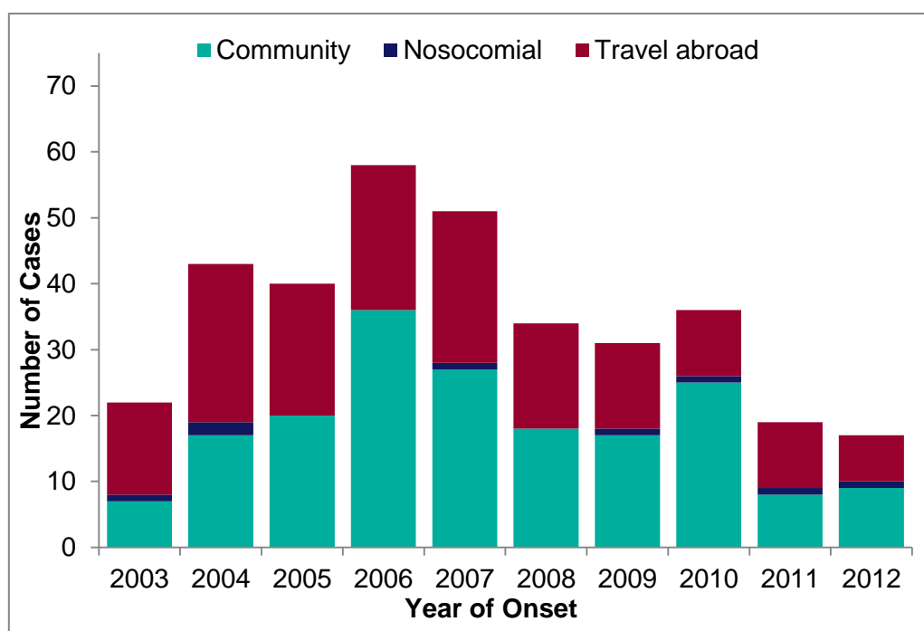
Figure 2: Number of confirmed Legionnaires' disease cases o in residents of Yorkshire and Humber by year of onset and category; 2003-2012

o Confirmed LD case: diagnosis by culture, urinary antigen or FFR and evidence of pneumonia