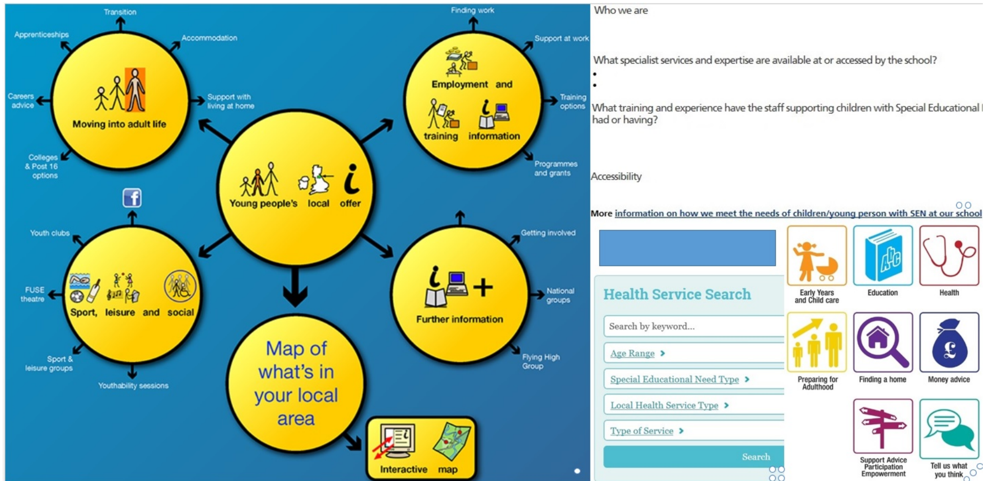
Figure 4 Some features of case study area LOs