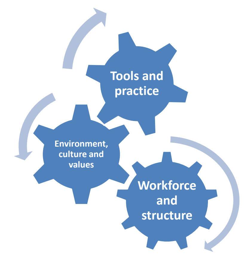
Figure 1 - Common ingredients of successful or promising approaches

Below, we have outlined the full range of factors that came through in our analysis of successful or promising approaches.