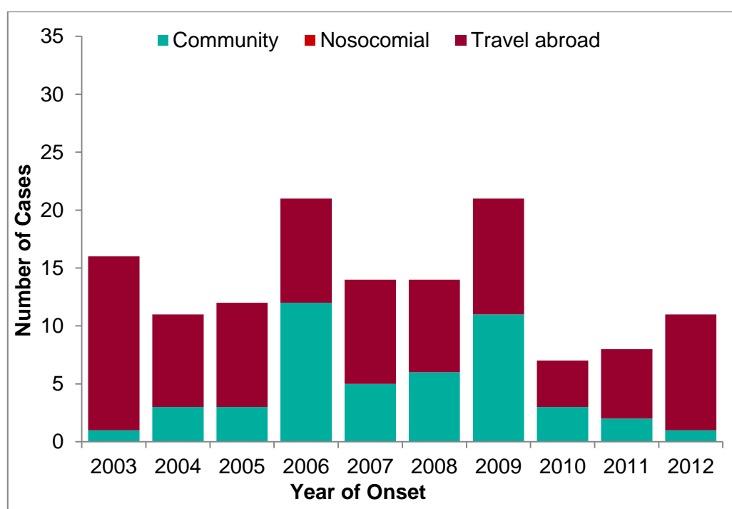
Figure 2: Number of confirmed Legionnaires' disease cases o in residents of Greater Manchester by year of onset and category; 2003-2012

o Confirmed LD case: diagnosis by culture, urinary antigen or FFR and evidence of pneumonia