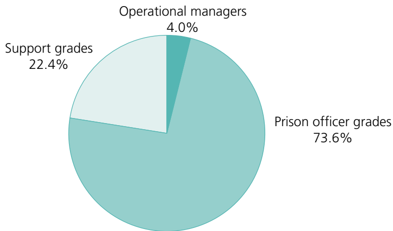
Our remit group in England and Wales, as at 31 December 2012

At the end of December 2012, there were 30,821 staff in our remit. The composition is shown below.