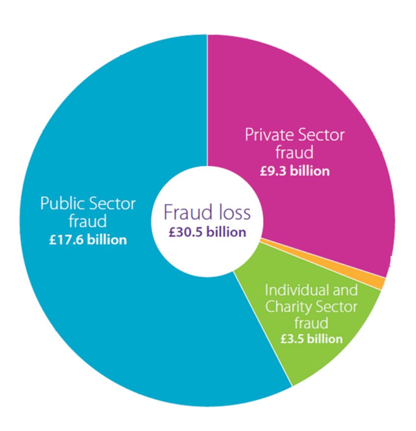
Figure 1 - Breakdown of fraud loss in the UK (2008)<sup>1</sup>