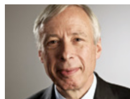
Earl Howe Under Secretary of State for Quality (Lords)