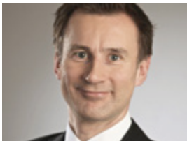
Rt Hon Jeremy Hunt MP Secretary of State for Health

The Secretary of State for Health is ultimately accountable to Parliament and the public for the health and care system as a whole. He has a duty to promote a comprehensive health service, which dates back to the NHS founding Act of 1946. The Secretary of State is supported by four health ministers.