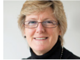
Professor Dame Sally Davies Chief Medical Officer