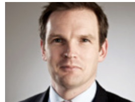
Dr Daniel Poulter MP Parliamentary Under Secretary of State for Health