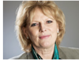
Anna Soubry MP Parliamentary Under Secretary of State for Public Health