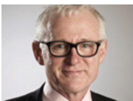
Norman Lamb MP Minister of State for Care and Support