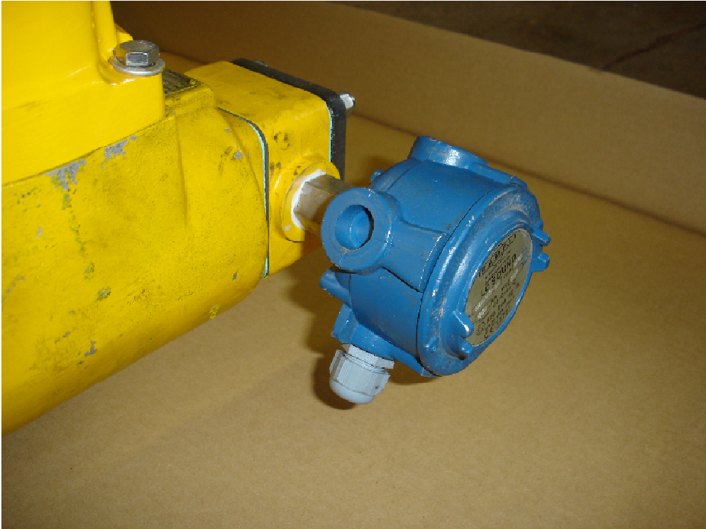
Figure 1 LC Sound Sensor