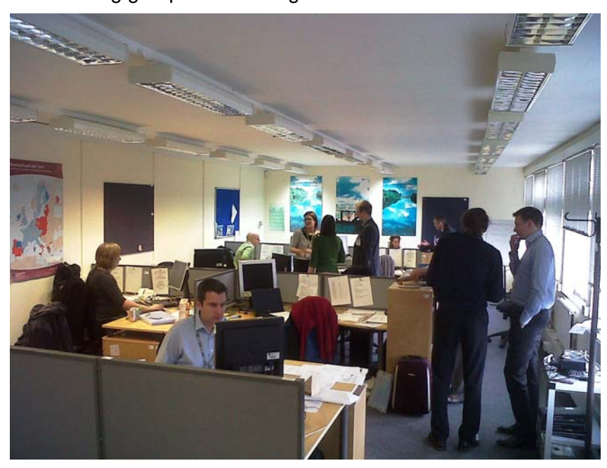
Technical teams supporting the National Incident Room

During this exercise 13 area incident rooms opened across the country, supported by all eight of our regional incident rooms. Our National Incident Room pulled together the overall picture and as described in our Major Incident Response Plan, the Strategic Management Team gave direction and the National Press Team managed information. Our liaison officers worked with local emergency response partners at 14 strategic coordinating groups across England and Wales.