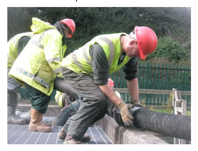
Emergency pumping by operations delivery teams at St Blazey in Cornwall

Operationally, we issue flood warnings, predict the impact of flooding, and manage flood defences to protect communities and critical infrastructure.