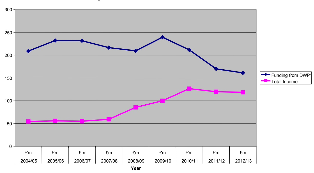
Table 3: HSE's funding and income 2004/5 to 2012/13

3.5 Table 3 shows HSE's funding and income 2004/5 to 2012/13. HSE's funding is from Government (known as grant-in-aid) and income is what it receives from other sources (see Annex C – Background to HSE). This shows that, in the last three years, the rate in reduction in Government funding has been accelerated but HSE has faced steadily decreasing funding over a much longer period. The grant-in-aid has increased in only two out of the last eight years. What is certainly true is that HSE has been and will be required to recover a greater proportion of its costs by charging for services and/or recovering the costs of its regulatory work if it is to maintain current activity levels.