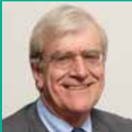
Richard Lambert Director-General, Confederation of British Industry (CBI)

Richard became Financial Editor at the Financial Times in 1979. He became Editor in 1991 and during his 10 years in this role launched the US version of the newspaper. In 2002, Richard was asked to write the Lambert Review of Business Collaboration. In Spring 2003 Richard became a member of the Bank of England's Monetary Policy Committee, stepping down in April 2006. He has been Director-General of the CBI since 1 July 2006. Richard is a trustee of the British Museum and Chancellor of Warwick University.