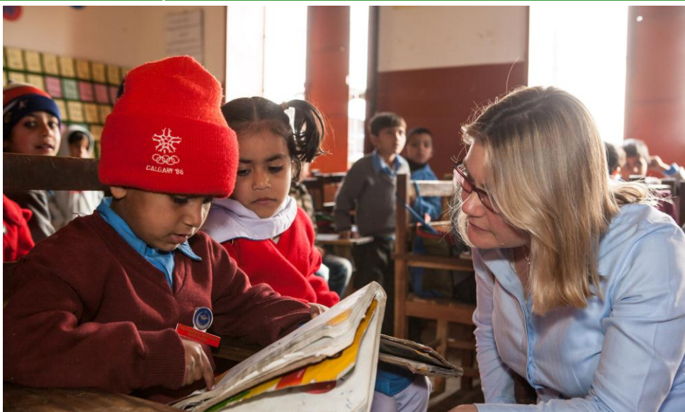
Justine Greening, Secretary of State for DFID, January 2013 visited a school in Rawalpindi.

2.5 million people have received assistance since the devastating floods in 2010. Includes: emergency lifesaving aid; provision of flood-resistant homes; seeds and livestock for families.