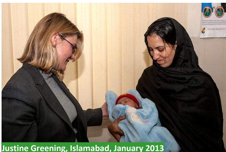
Justine Greening, Islamabad, January 2013

"The UK's support to this programme will help to increase awareness of health care to prevent such needless deaths, will improve nutrition and immunisation services, and will make it easier for people to get the skilled help they need from community midwives and birth attendants."