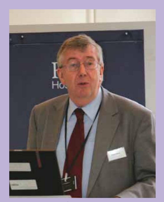
Lord McKenzie of Luton, Department for Work and Pensions Minister, addresses attendees

1.9 The child maintenance White Paper was available in a variety of formats, as was the accompanying Regulatory Impact Assessment. We distributed over 1,300 copies of the White Paper, in addition to those that people may have downloaded directly from our website.