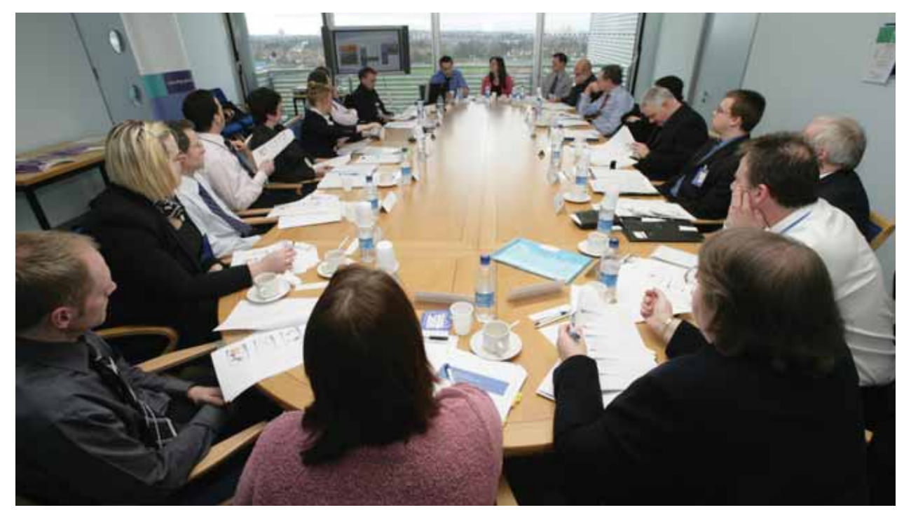
The Child Support Agency's Employers' Forum

how they might affect them. The group also discussed the proposal to test withholding from wages as the first means of collecting maintenance, as part of our commitment to work closely with employers during the policy's development.