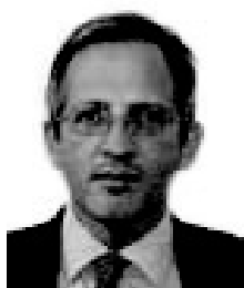
Sir Jon Cunliffe CB