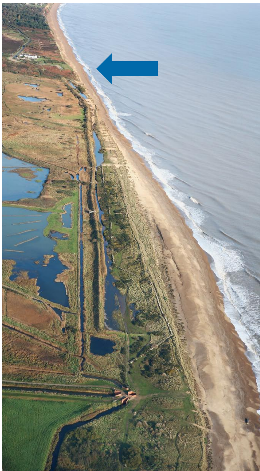
Photo 3: The Minsmere Frontage and Area of Increased Risk of Breach

As the effectiveness of the sluice and outfall declines, freshwater flooding of the land behind the defences will become more frequent.