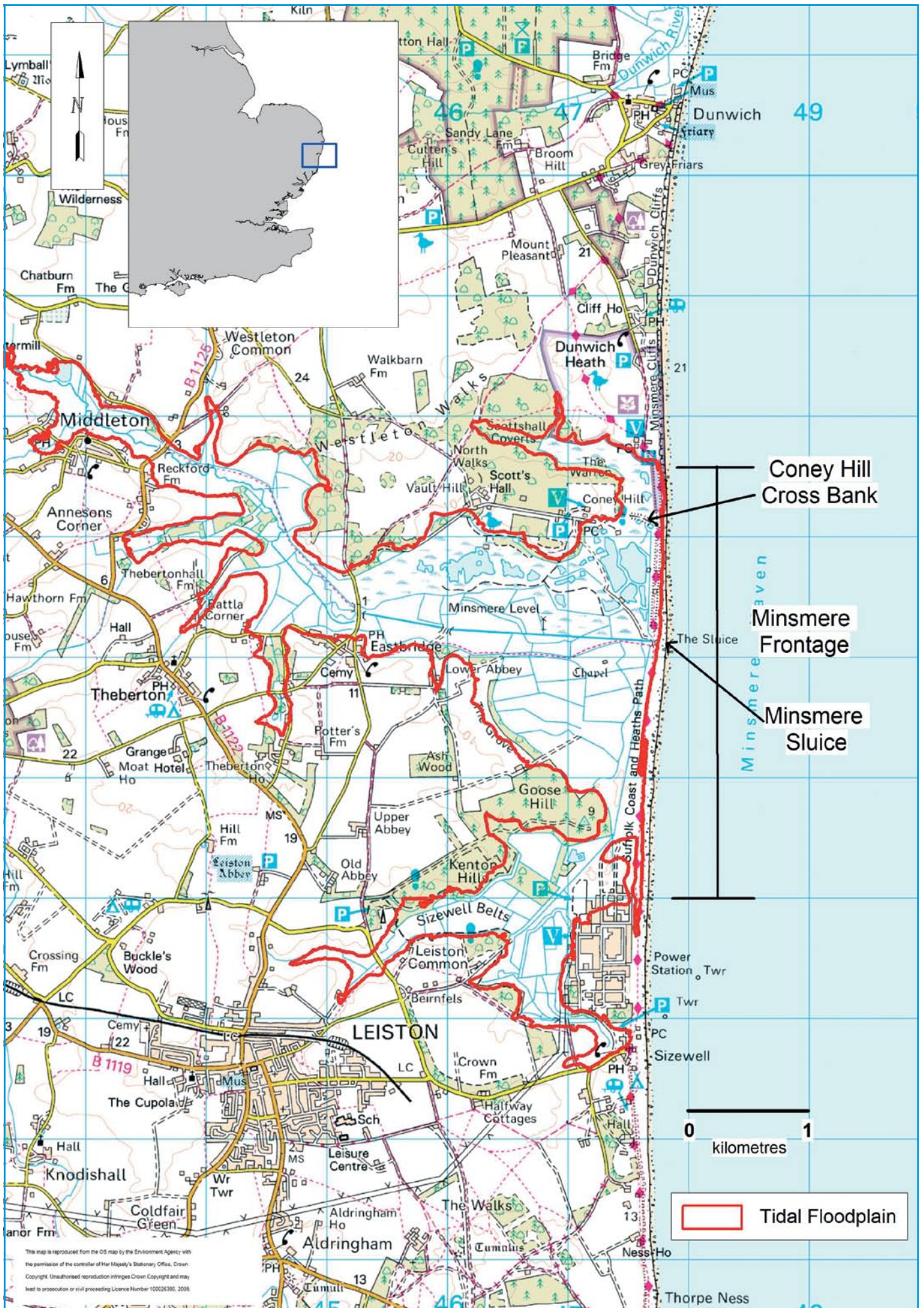
Figure 1: The study area