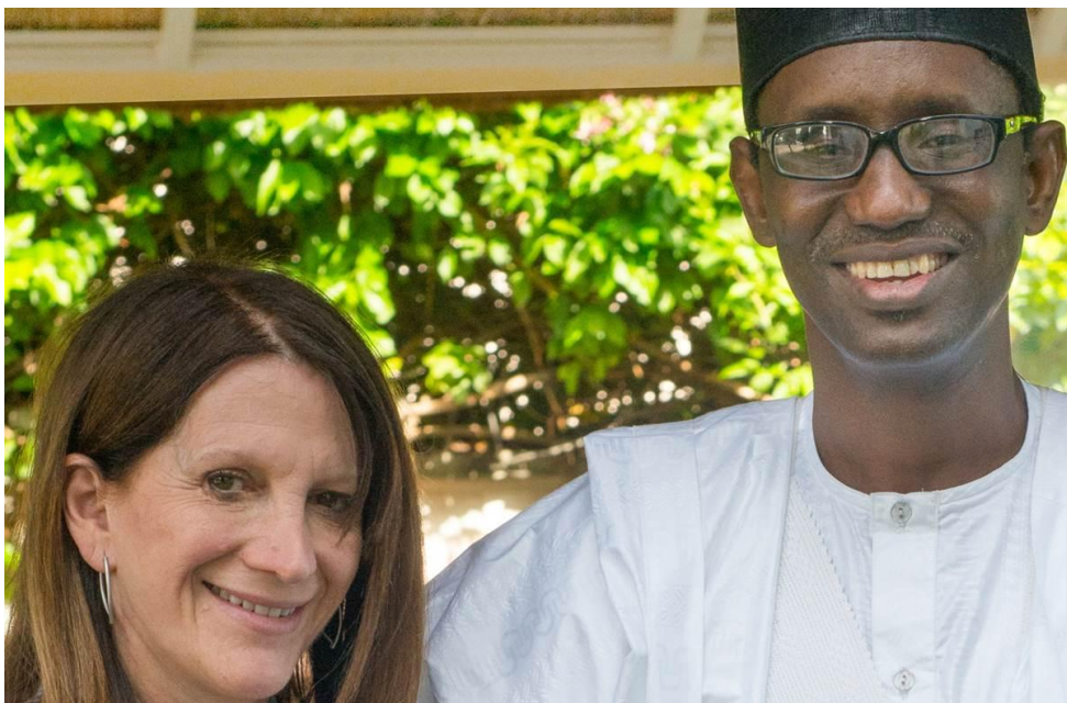
Lynne Featherstone, Parliamentary Under Secretary of State, May 2013 met Nuhu Ribadu, Chairman of the Petroleum Revenue Task Force.

We supported elections where 40 million people voted in 2011 and will support elections in 2015 when 55 million people will vote.