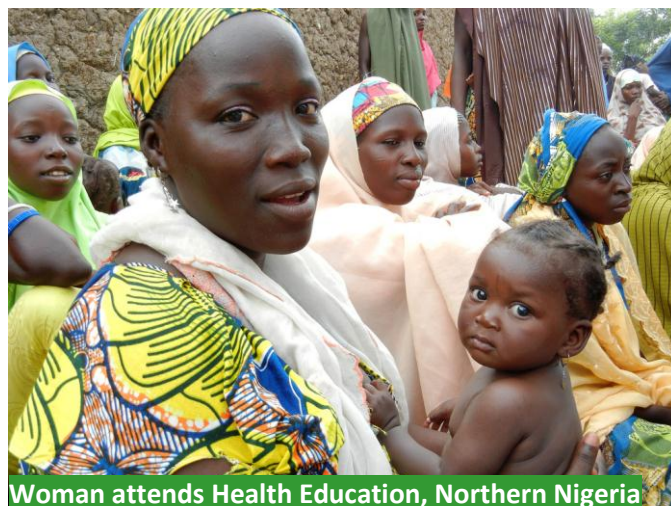
Woman attends Health Education, Northern Nigeria

"That is why the UK will help women and girls across the country to come together and find a united voice, improving access to health, education and jobs."