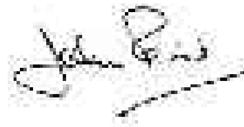
John Reid Secretary of State for Health

We must meet the aspirations of the public. Tens of thousands of people have already taken the trouble to engage directly in our consultation process and to turn the NHS from a top down monolith into a responsive service that gives the patient the best possible experience. We need to develop an NHS that is both fair to all of us, and personal to each of us.