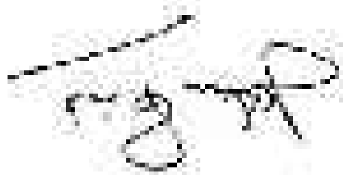
John Reid Secretary of State for Health

is a healthier patient and a resource – the drugs – actually being used. We know from our pilots on choice in elective care that patient choice drives the efficient use of resources.