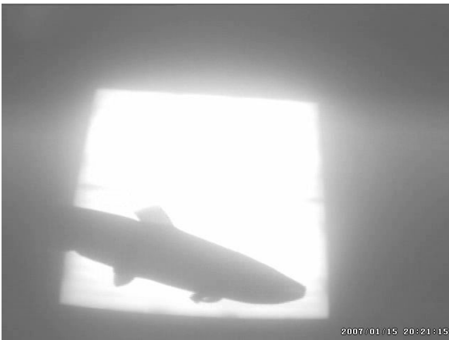
Figure 3.2: Example data collected during light panel trials at Cynrig Hatchery

Infrared illuminators and lamps were tested during Year 1 and deployed on sites to either illuminate the target from above or to provide background illumination. The latter was achieved by bouncing the light off a white polypropylene sheet positioned in the camera field of view. The drawback with these lamps is that they have to be positioned