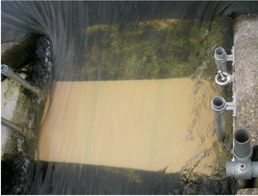
Figure 3.5: Fish pass exit showing light panel and scaffold to which camera was attached