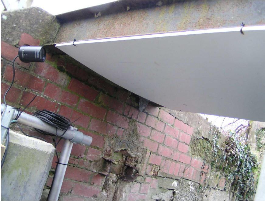
Figure 3.10: Infrared light reflected off white polypropylene sheet above fish pass exit