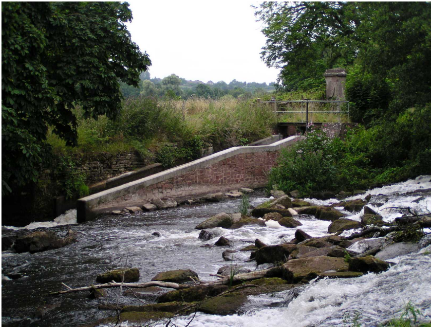
Figure 3.9: Larinier fish pass at Hampton Court on the River Lugg

An X200 DVR was deployed at Hampton Court on the River Lugg (Figure 3.9). An upwards-looking underwater camera was mounted beneath the fish pass exit and infrared light reflected off a white board positioned out of the water above the camera (Figure 3.10). Data were collected from this site during the first year of the project using an analogue video recorder, but the quality of these images was relatively poor compared to those obtained from the X200. The DVR was reliable and drew very little power; however, processing the data was time-consuming as the files had to be decrypted. Unfortunately, few fish were observed during the period of deployment.