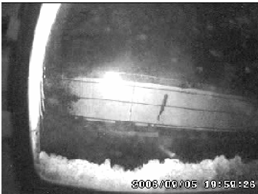
Figure 3.8: Example image collected at Manley Hall using the camera and lighting gantry