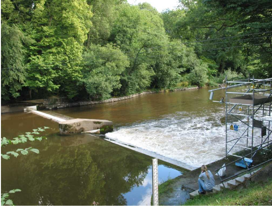
Figure 3.7: Manley Hall resistivity counter site showing the camera and lighting gantry

A camera and floodlight were deployed on a scaffolding tower looking down onto a section of the weir face (Figures 3.7 and 3.8), with data collected onto an external hard drive via a DVR card in a reconfigured PC. The primary aim of the deployment was to validate the existing resistivity counter.