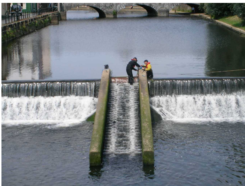
Figure 3.4: Installing equipment at Haverfordwest Town Weir fish pass

A single underwater camera and cables were installed at the top end (exit) of the fish pass in 2005 (Figure 3.4) and data recorded during daylight hours via a digital video recorder (DVR) card within a PC onto an external hard drive.