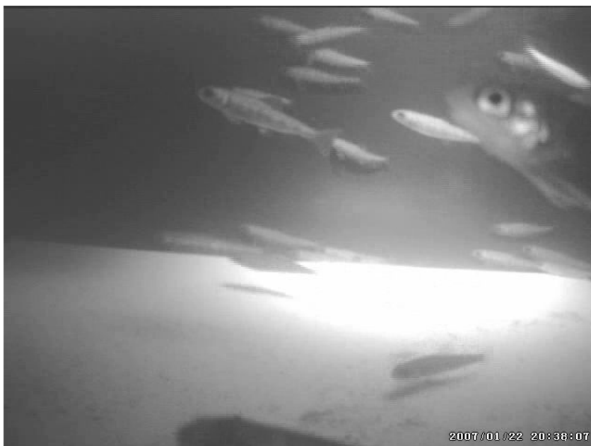
Figure 3.3: Example data collected using infrared illuminator in trials at Cynrig Hatchery

out of the water and shone through the water surface, as they are not submersible. A prototype of an IP68 rated (fully submersible) infrared LED illuminator, developed by British company Pro-Optocam, was acquired and was also tested at fish hatchery tanks (Figure 3.3).