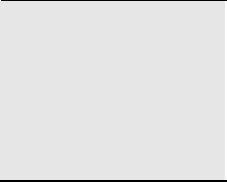
Table 4 – Impacts by Stakeholder