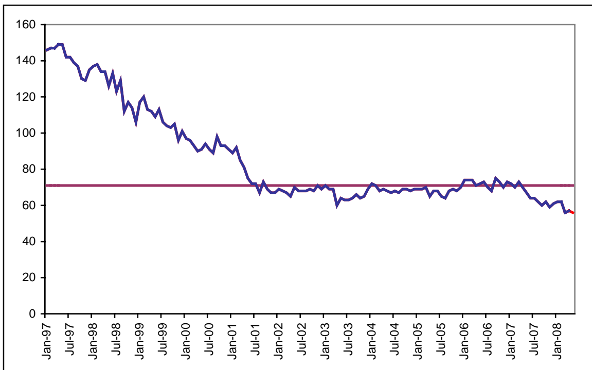
Figure 1: Average time (days) between arrest and sentence for persistent young offenders – England and Wales, January 1997 to April 2008

Further figures can be found in table 1 (page 6). A graph showing monthly progress from January 1997 is shown in figure 1 below.