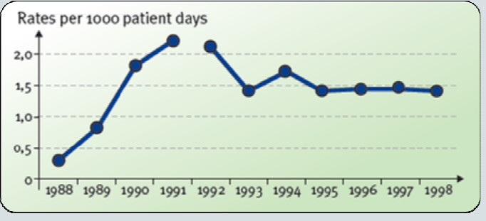
Figure 3. Rates of nosocomial Clostridium difficile, expressed per 1,000 patient-days, before and after implementation of the antibiotic management program. Source: Carling P, et al 2003<sup>10</sup>

*NNIS is now the National Healthcare Safety Network (NHSN).